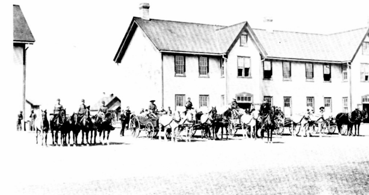
NWMP DETACHMENT TEAMS LEAVING REGINA FOR WOOD MOUNTAIN, MAY, 1885 — Under the patrol system set up by Commissioner Herchmer, it was customary for outposts to be opened in outlying areas for the summer and withdrawn in the autumn. In 1885, Regina district members patrolled 553,000 miles with horses.