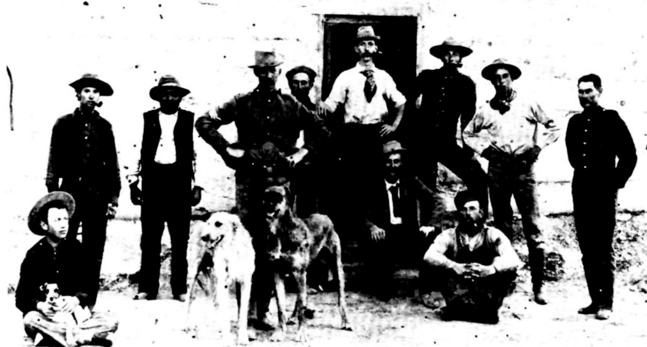
BATTLE CREEK (FORMERLY TEN-MILE) 1891 — First established under canvas in 1875 on the Boston trail at the Battle Creek crossing, this detachment continued as a summer outpost until 1890 when several log buildings were erected. It was occupied almost continuously until the end of 1917.

When the North West Mounted Police set out across the western plains in 1874 very little was known of the geography of the vast territory that had become their responsibility for law and order. The locations of the major features of the topography were recognized — the Rocky Mountains to the west, the forests to the north of the plains and the courses of the larger rivers. There was a well-established trade route from Fort Garry along the North Saskatchewan River to Fort Edmonton.