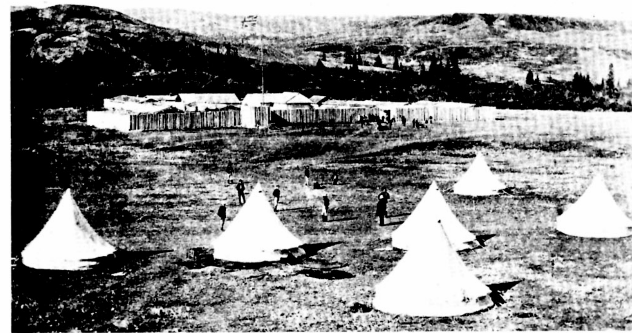
FORT WALSH, 1878 — Built in 1875 by Capt. J. M. Walsh near the site of the "Cypress Hills Massacre" of 1873 that had hastened the formation of the Force, Fort Walsh was Headquarters of the NWMP from 1878 to 1882. Mandated in 1883, its site was re-occupied 60 years later and used as the Force's horse breeding station until 1908. It is now a National Historic Site.