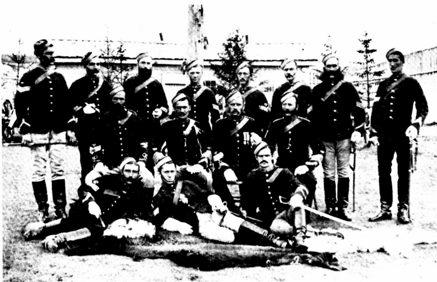
N.C.O.s AT FORT WALSH — In front of the Commissioner's residence in 1878. This building was built in 1878 when the Headquarters of the Force was moved from Fort Macleod.