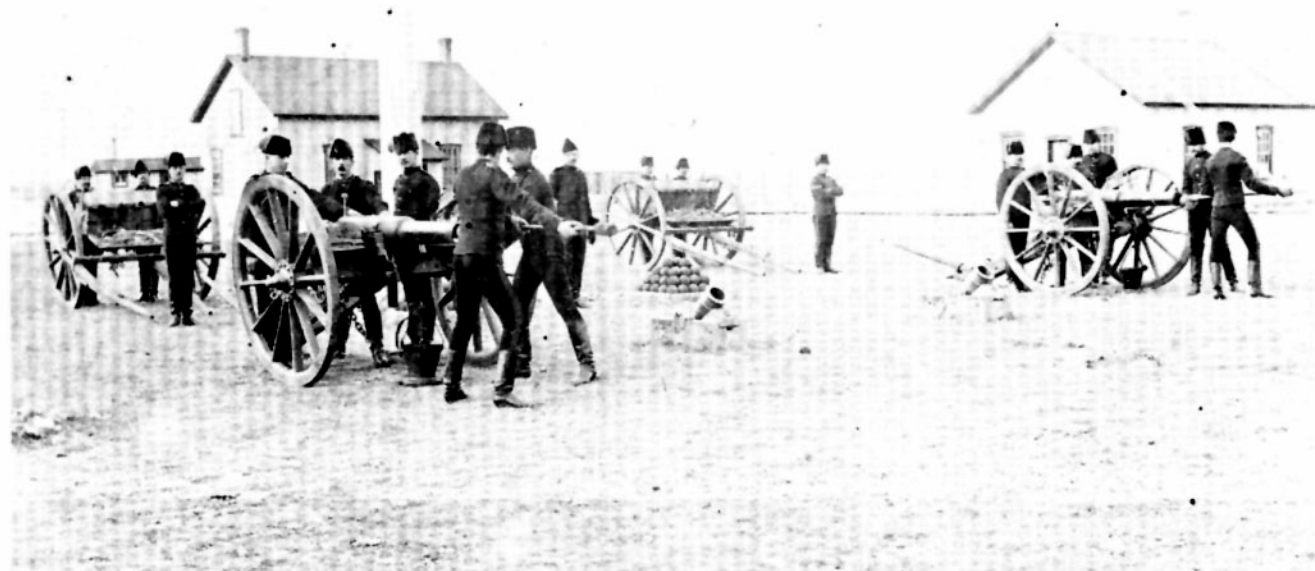
NWMP ARTILLERY DETACHMENT AT FORT MACLEOD DECEMBER 17, 1880 — The brass mortars and 5-pounder cannons illustrated were brought west by the Force on the great trek of 1874.