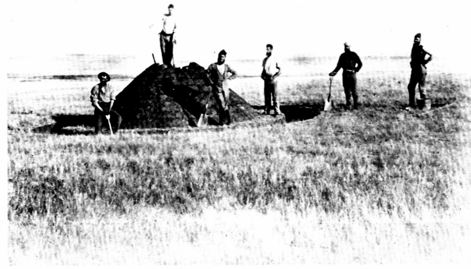
BOUNDARY COMMISSION 1873 — Supporters of the North American Boundary Commission building a "boundary mound" in 1873. These mounds marked the 50th Parallel and thus indicated the limit of jurisdiction of the U.S. Cavalry to the south and the North West Mounted Police to the north.