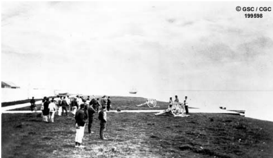
Figure 1: Photograph of the Arrival of the Supply Ship at York Factory

When Canada took over the Northwest Territories, they included the continental territories whose waters flowed into the Arctic and Pacific Oceans. On July 31, 1880, an Imperial Order in Council transferred to Canada all of the British territories and possessions left in North America (except for the colony of Newfoundland), and also the islands next to these territories and possessions. This document transferred the Arctic Islands to Canada, but it did not describe the territory added to Canada or its boundaries.