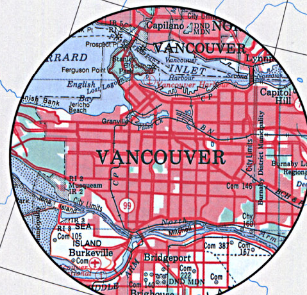
92G SCALE 1:250 000