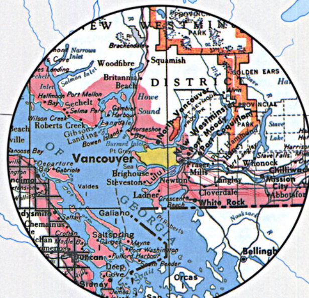
MCR 3 SCALE 1:2 000 000

SOURCES Canada, Department of Energy, Mines and Resources, Surveys and Mapping Branch, National Topographic System / Système national de référence cartographique. Maps: North Vancouver 92G/6, scale 1:50 000, Vancouver 92G, scale 1:250 000, Ottawa. 1987. Maps of the National Topographic System of Canada / Cartes du système national de référence cartographique. Index 1, 2, and 3, Ottawa. International Map of the World / Carte internationale du monde. Map: Vancouver NM-9/10, scale 1:1 000 000, Ottawa. Canada, Department of Fisheries and Oceans, Canadian Hydrographic Service. 1987. Geoscientific Publications / Publications géoscientifiques. Catalogue no. 5, Ottawa. Research and cartography by the Geographical Services Division, Canada Centre for Mapping, Energy, Mines and Resources Canada.