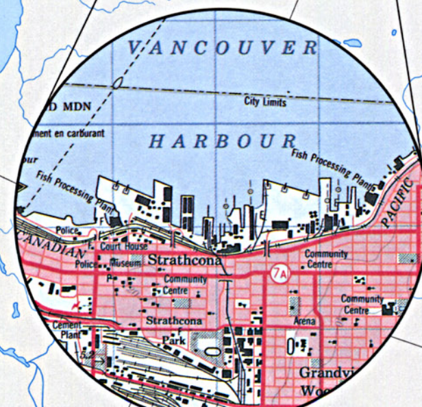
92G/6 SCALE 1:50 000