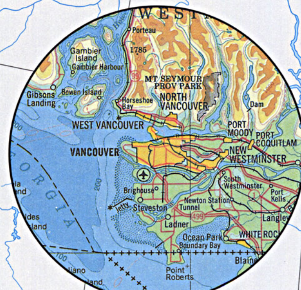
NM-9/10 SCALE 1:1 000 000