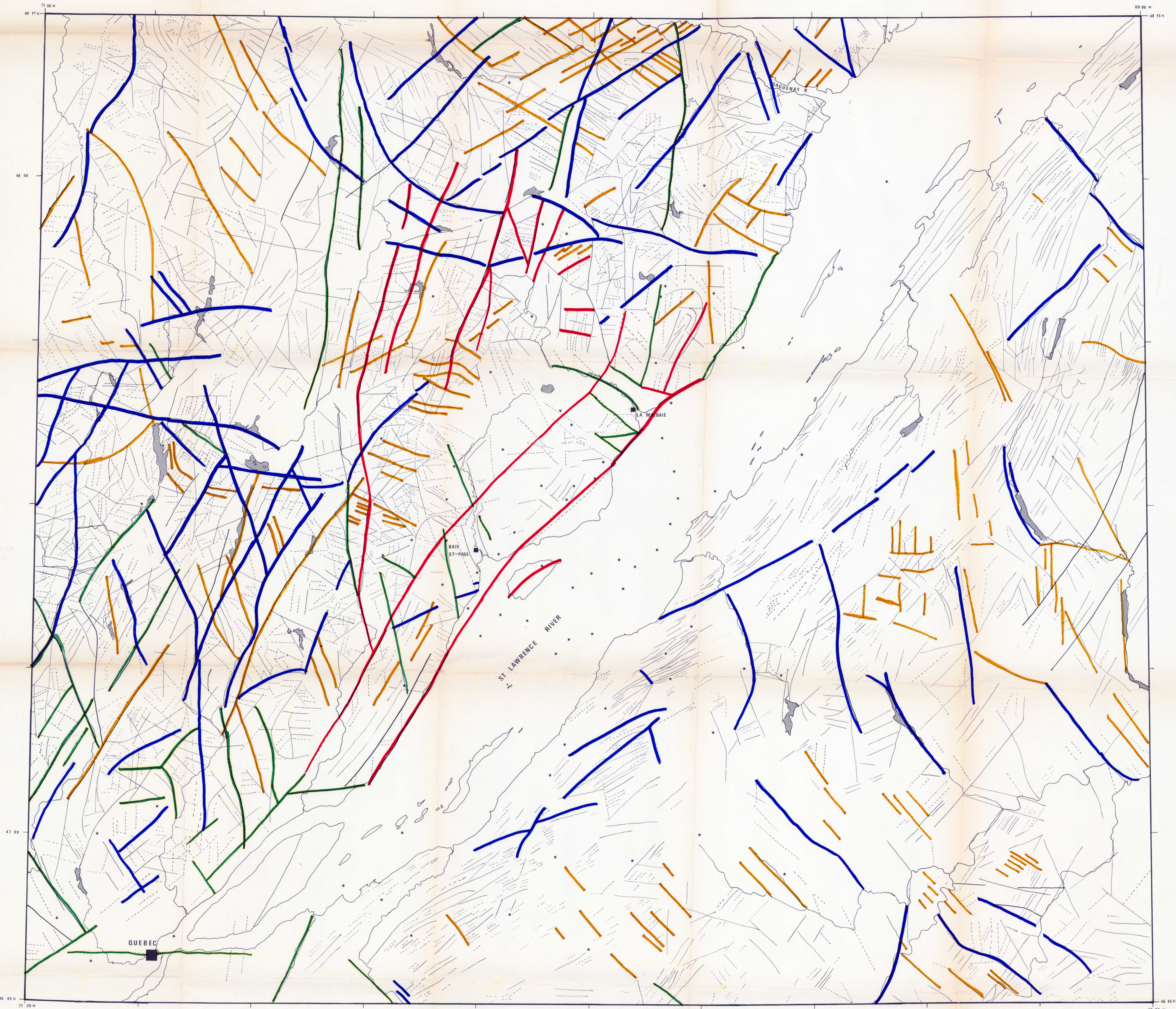
MAP NO. 2