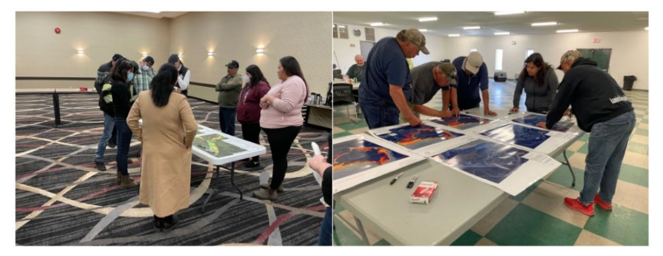
Figure 2. (left) Members of Sioux Valley Dakota Nation reviewing flood maps as part of the pilot session held in Brandon, MB, on March 17, 2022. (right) Members of Métis Local #42 reviewing flood maps as part of the pilot session held in Cumberland House, SK, on August 22, 2022.

The pilot session for Métis Local #42 was attended by a diverse group of ten Métis citizens and guests from Cumberland House, a historic community in northern Saskatchewan. The attendees represented various roles and interests in the community, such as Elders and leadership, culture, environment, economy, and social services. They shared their perspectives and experiences on how flooding affects their lives and livelihoods, and how they can adapt to the challenges and opportunities it presents.