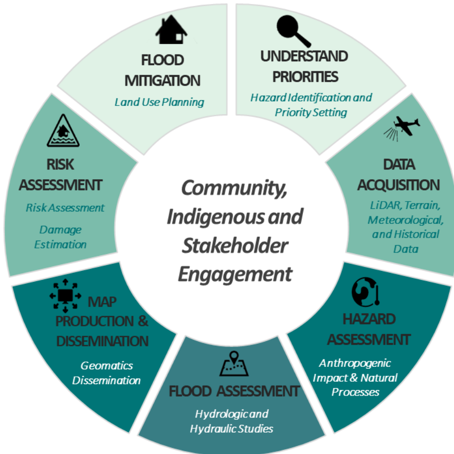
Figure 1: Flood Mapping Framework

The Flood Mapping Framework consists of all the components of the flood mitigation process, from flood hazard identification to the implementation of flood mitigation efforts. Figure 1 illustrates the relationship between these different components.