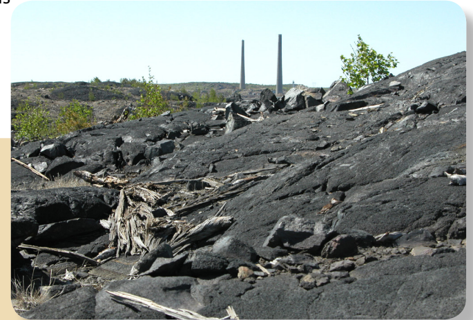
Stop 1: A view of impacted landscape in 2005 south of the twin chimneys of the former Coniston smelter. Emissions from the smelter severely damaged the vegetation in the Coniston area.

The tourist information kiosk has a view to the south of the Coniston region and the distinctive twin chimneys of the former Coniston smelter on the skyline. In 1978, the tourist information kiosk site and the area around it were rocky barrens without vegetation. Coniston was the site of a mine, an early roast bed and a smelter that operated from 1913 to 1972.