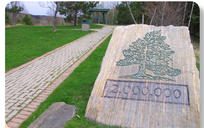
Stop 2: A marker celebrating the planting of the 2 millionth tree in 1994.

This remarkable reclamation effort reflects the hard work of 10 000 volunteers and 4500 land reclamation employees in a partnership between the City of Greater Sudbury, mining companies, volunteer groups, Provincial and Federal governments and local businesses. Regreening has helped lakes to return to their natural acidity, slowed rainwater run-off into creeks and culverts, and reduced erosion. This transformation has changed the image of Greater Sudbury, help to attract new businesses and increase tourism, and give residents a new respect for their environment. Reclaimed areas now support wildlife, recreation and walking trails. The City of Greater Sudbury has received numerous awards for its leadership in the environmental restoration of mining landscapes.