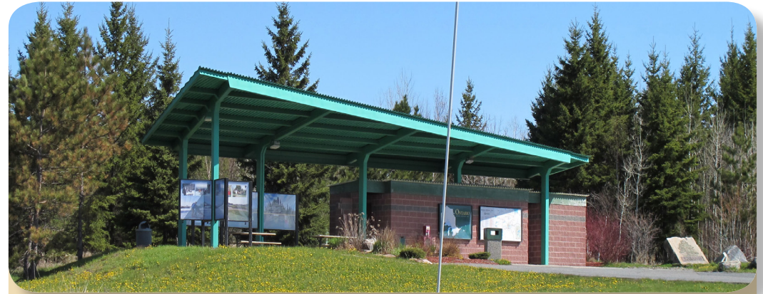
The trail starts at the Coniston tourist information kiosk and follows a route through the forest behind the kiosk.

The Jane Goodall Reclamation Trail is located at the Coniston tourist information kiosk on Highway 17, about 12 km east of Greater Sudbury's city centre. The 1 km trail loops through young forest to 2 lookouts (stops 4 and 5 on map). A trail guide (available at www.rainbowroutes.com/index.php/routes/jane-goodall/ ) describes 9 points of interest that are marked with posts along the trail. This GeoTour provides additional commentary about the sites at several marker posts.