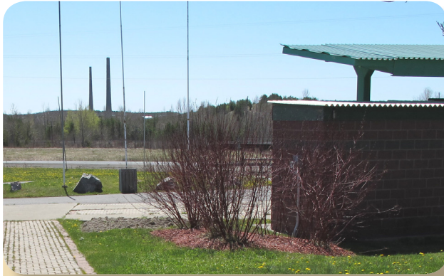
Stop 1: View to the south from tourist information kiosk across Highway 17 towards the twin chimneys of the former Coniston smelter.