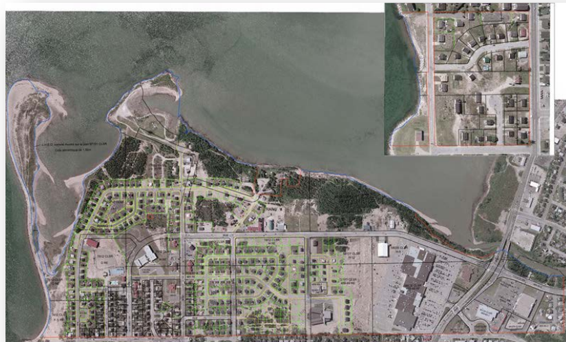
Figure 3 - parcel fabric renewal pilot project – Uashat First Nation Quebec

The Community Parcel Plan concept facilitates these added criteria and allows the application of “Fit for Purpose” principles to co-exist in a cohesive manner with existing systems such that a “made in Canada” variant is possible. The key is bridging between the formal federal and provincial systems of land administration and the local needs of a community.