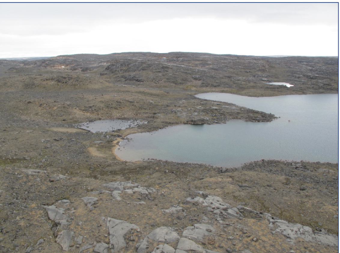
Figure 3. Closely eroded landscape featuring till veneer and bedrock, southern Hall Peninsula, Baffin Island, Nunavut.