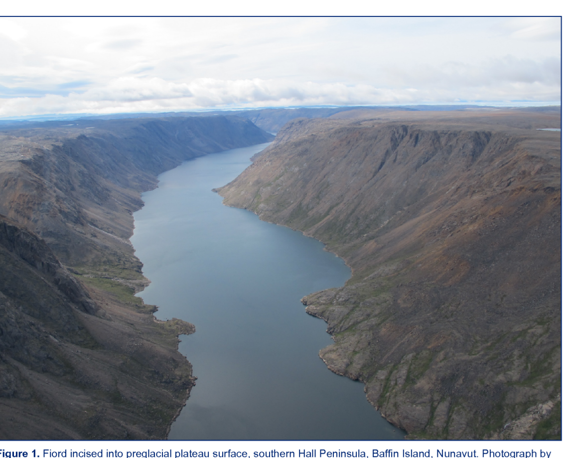
Figure 1. Flow incised into preglacial plateau surface, southern Hall Peninsula, Baffin Island, Nunavut.