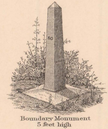
Boundary Monument 5 feet high

Boundary Monuments On original sites ■ On new sites □