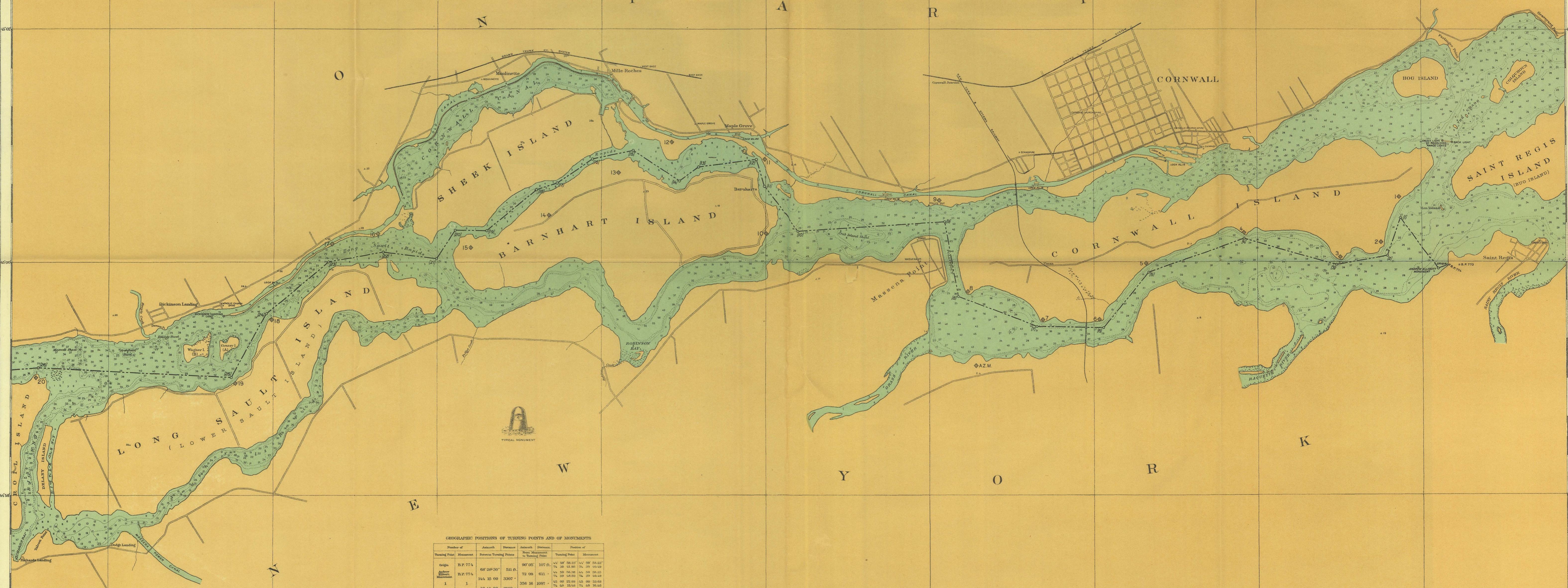
GEOGRAPHIC POSITIONS OF TURNING POINTS AND OF MONUMENTS

1319280 Boundary Reference Monument Boundary Turning Point Original Designation of Island (1813 ISLAND) = (43)