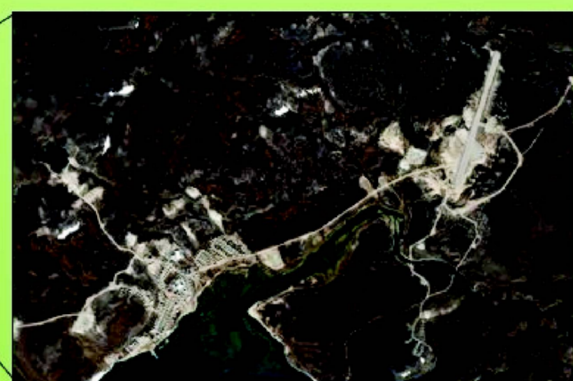
Quickbird image of Clyde River, 2006

Based on the 2007 field season, preliminary results can be concluded. Certain physical characteristics of Clyde River increase its susceptibility to landscape hazards. As the town is situated below marine limit, its underlie with continuous permafrost with a high saline content and fine marine sediments, which erodes easily, is found under many sections. The primary landscape hazards in Clyde River include differential subsidence, causing damage to infrastructure, especially in the low lying Eastern areas of town. Thermal erosion is resulting in bank erosion, threatening houses along the creek. Surface run-off is causing flooding, gulling, and erosion.