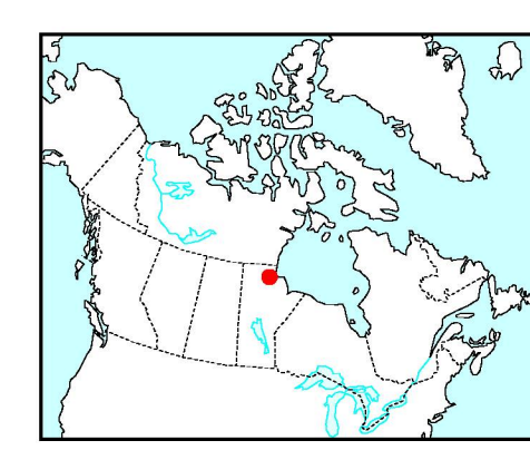
Location Map - Carte de Localisation

Notation bibliographique conseillée: Fortin, R., Coyle, M., Carson, J.M., et Kiss, F. 2009. Série des cartes géophysiques, SNRC 64-1/11, Manitoba. Levée géophysique aéroportée de la région de Great Island et Seal River, Manitoba. Commission géologique du Canada, Dossier public 6071. Levés géophysiques du Manitoba, Open File OF2009-7, échelle 1:50 000.