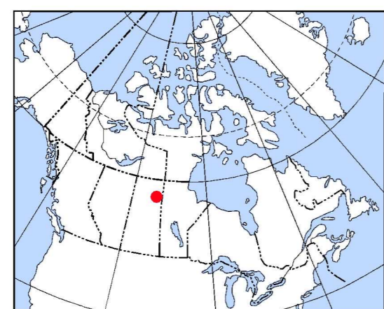
MAP LOCATION - LOCALISATION DE LA CARTE