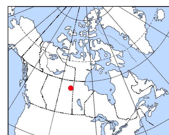
MAP LOCATION - LOCALISATION DE LA CARTE