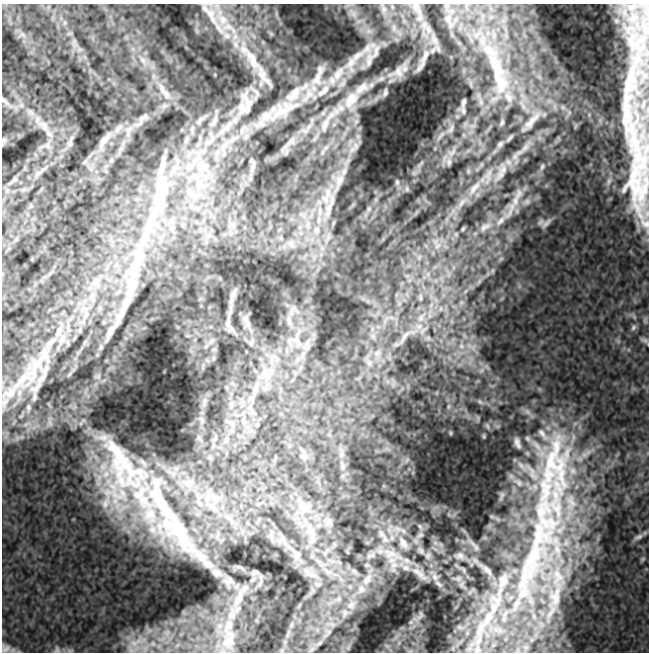
Figure 2. Subimage of RADARSAT F2F scene acquired on October 3, 1999 in the region of Guagua Pichincha.

This October 3 rd image is believed to be the first satellite image revealing growth and change of the lava dome which