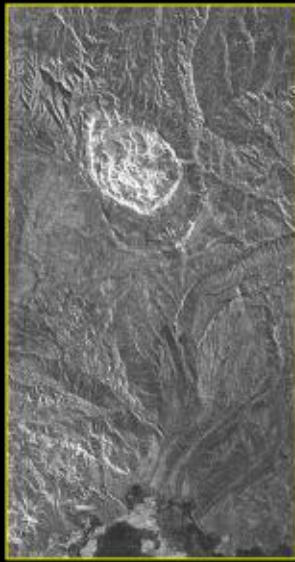
Scene Coherence Image Tandem ERS-1 / -2 (1-day interval) 09-Dec-95 / 10-Dec-95