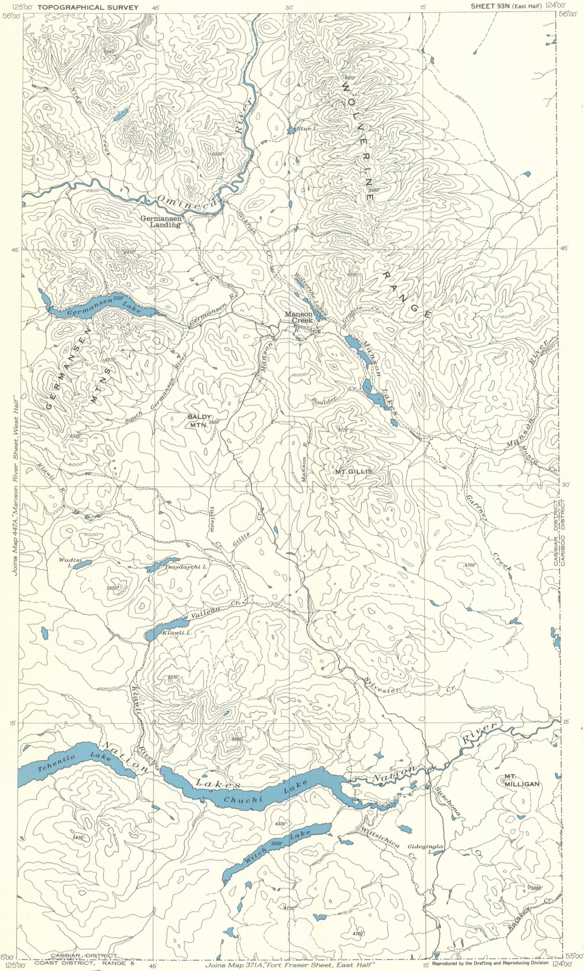
MAP 446A MANSON RIVER SHEET (EAST HALF) CASSIAR DISTRICT BRITISH COLUMBIA Scale, 253,476 or 1 Inch to 4 Miles Miles Kilometres Contour interval 500 Feet. Approximate magnetic declination, 30° East.

LEGEND Road (well travelled) ..... Trail ..... Post office ..... Land District boundary ..... Lake (position approximate) ..... Stream (position approximate) ..... Contours ..... Contours (position approximate) ..... Height in feet ..... 4330' 4760' Surveyed and compiled by the Topographical Survey. The names on this map have not been adopted by the Geographic Board of Canada.