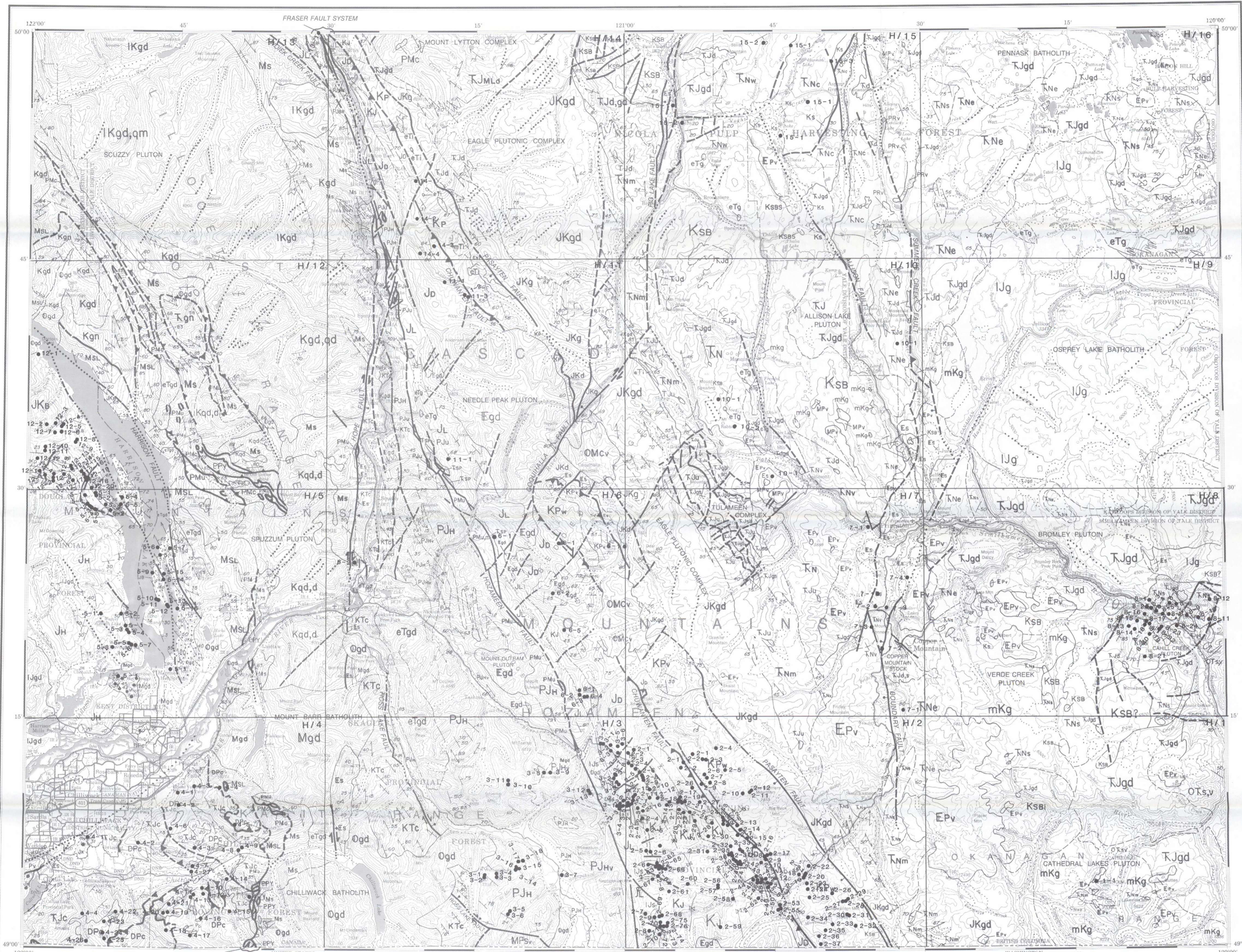
MAP 41-1989 SHEET 2 FOSSIL LOCATIONS HOPE BRITISH COLUMBIA