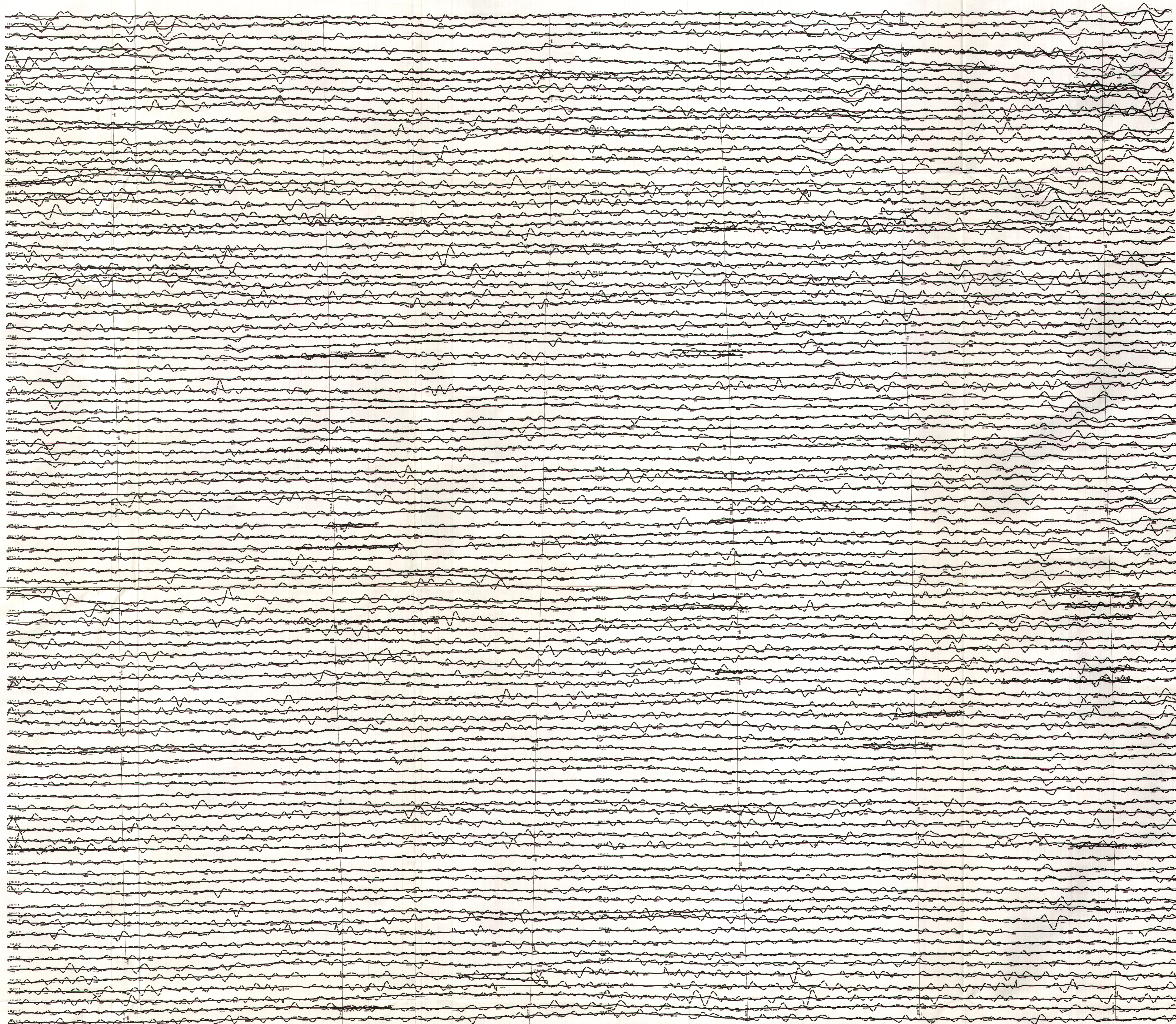
TOTEM VLF EM PROFILES FOR LINE STATION PROFILS DE TOTEM EM VLF POUR LA STATION EN LIGNE