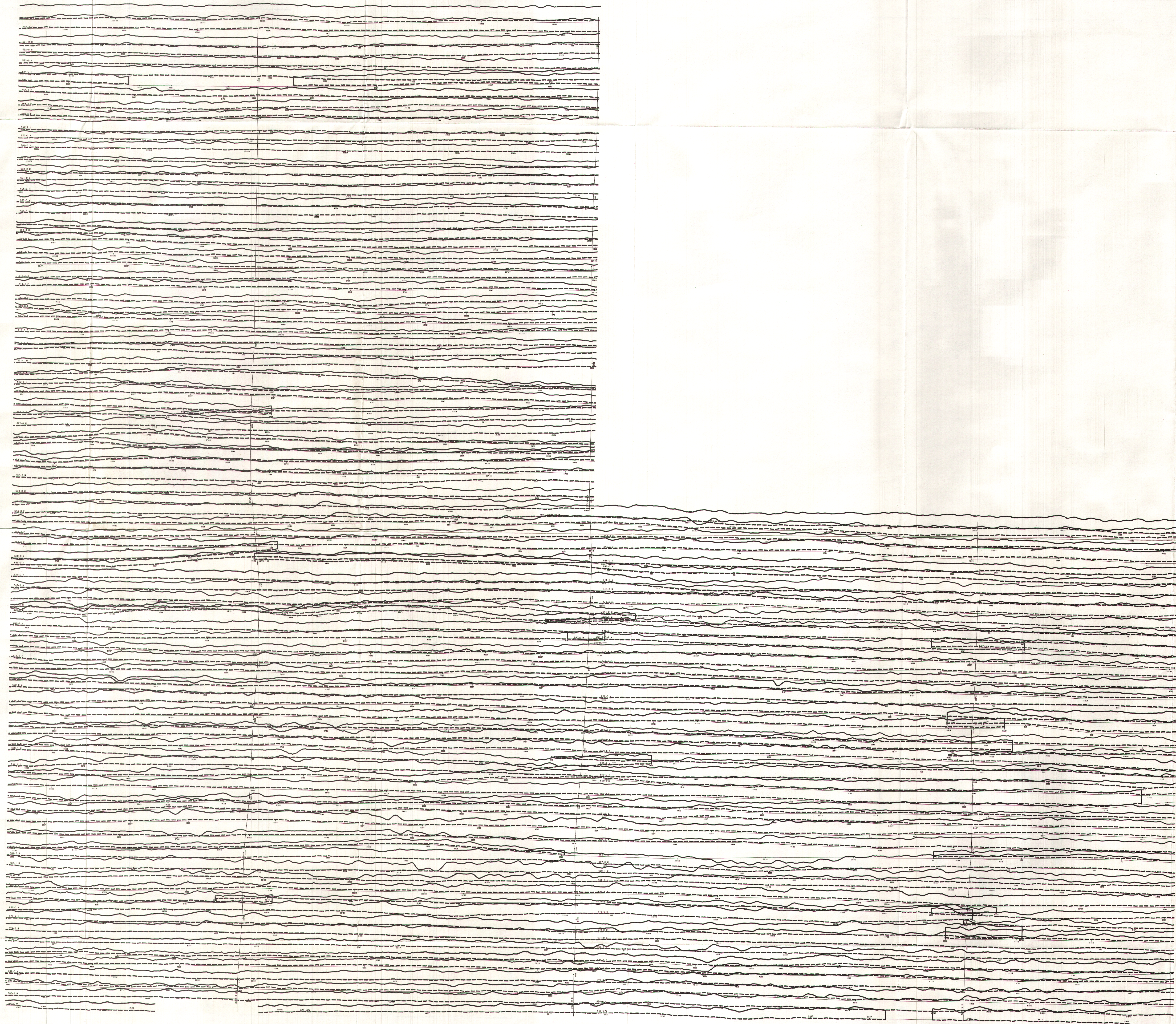
TOTEM VLF EM PROFILES FOR LINE STATION ( Annapolis ) PROFILS DE TOTEM VLF POUR LA STATION EN LIGNE ( Annapolis )