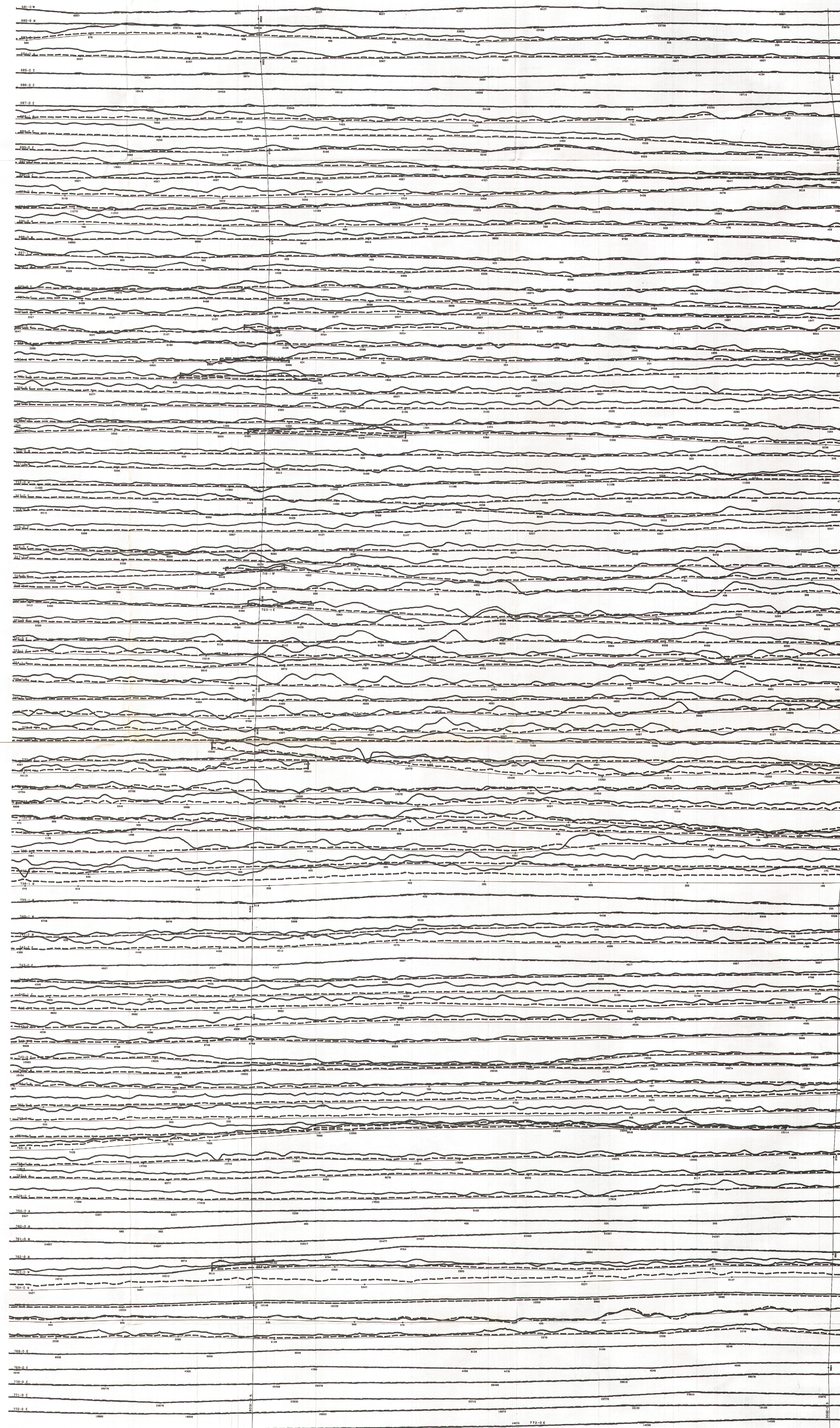
TOTEM VLF EM PROFILES FOR ORTHOGONAL STATION (Seattle) PROFILS DE TOTEM EM VLF POUR LA STATION ORTHOGONALE (Seattle)