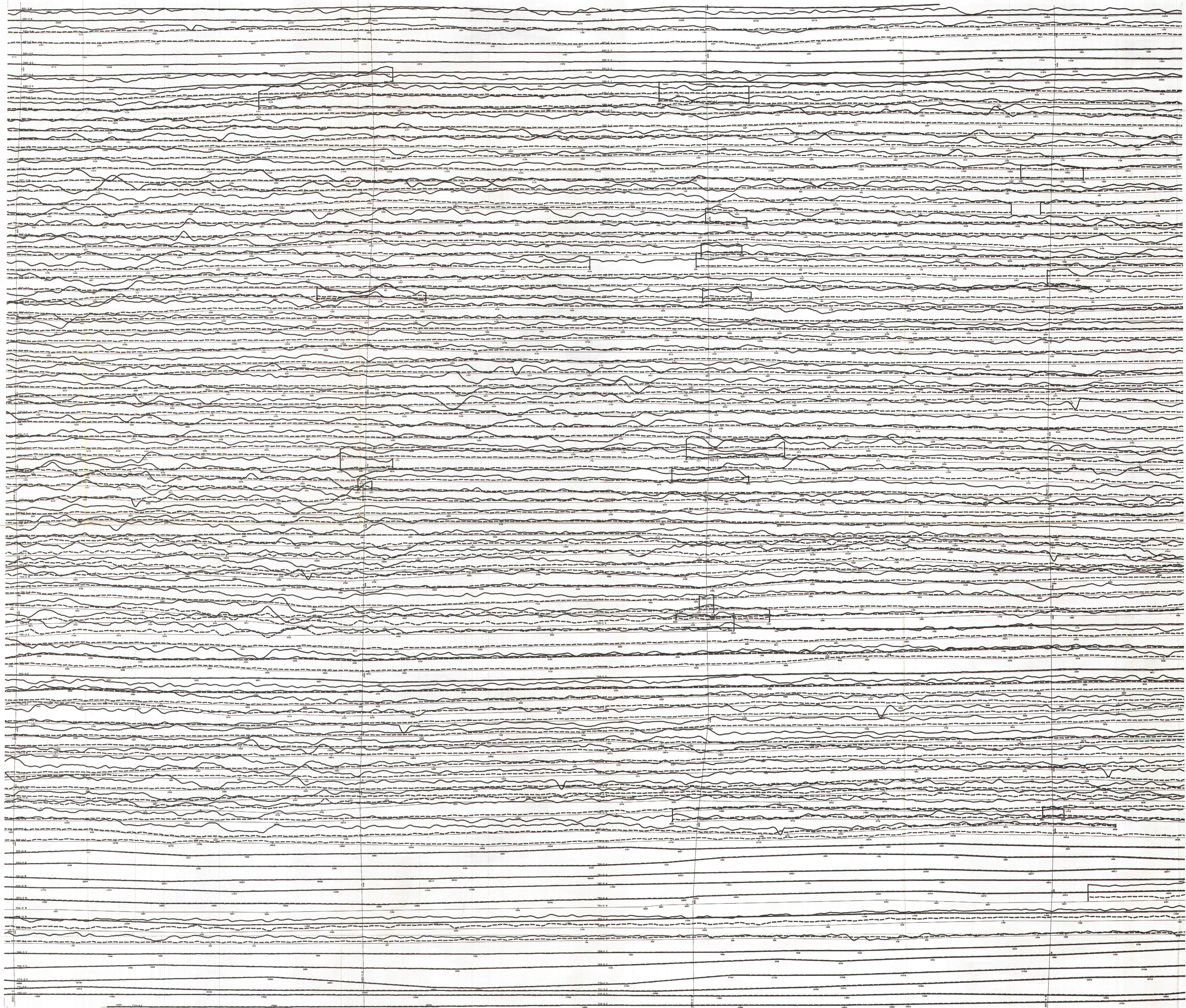
TOTEM VLF EM PROFILES FOR ORTHOGONAL STATION (Seattle) PROFILS DE TOTEM EM VLF POUR LA STATION ORTHOGONALE (Seattle)