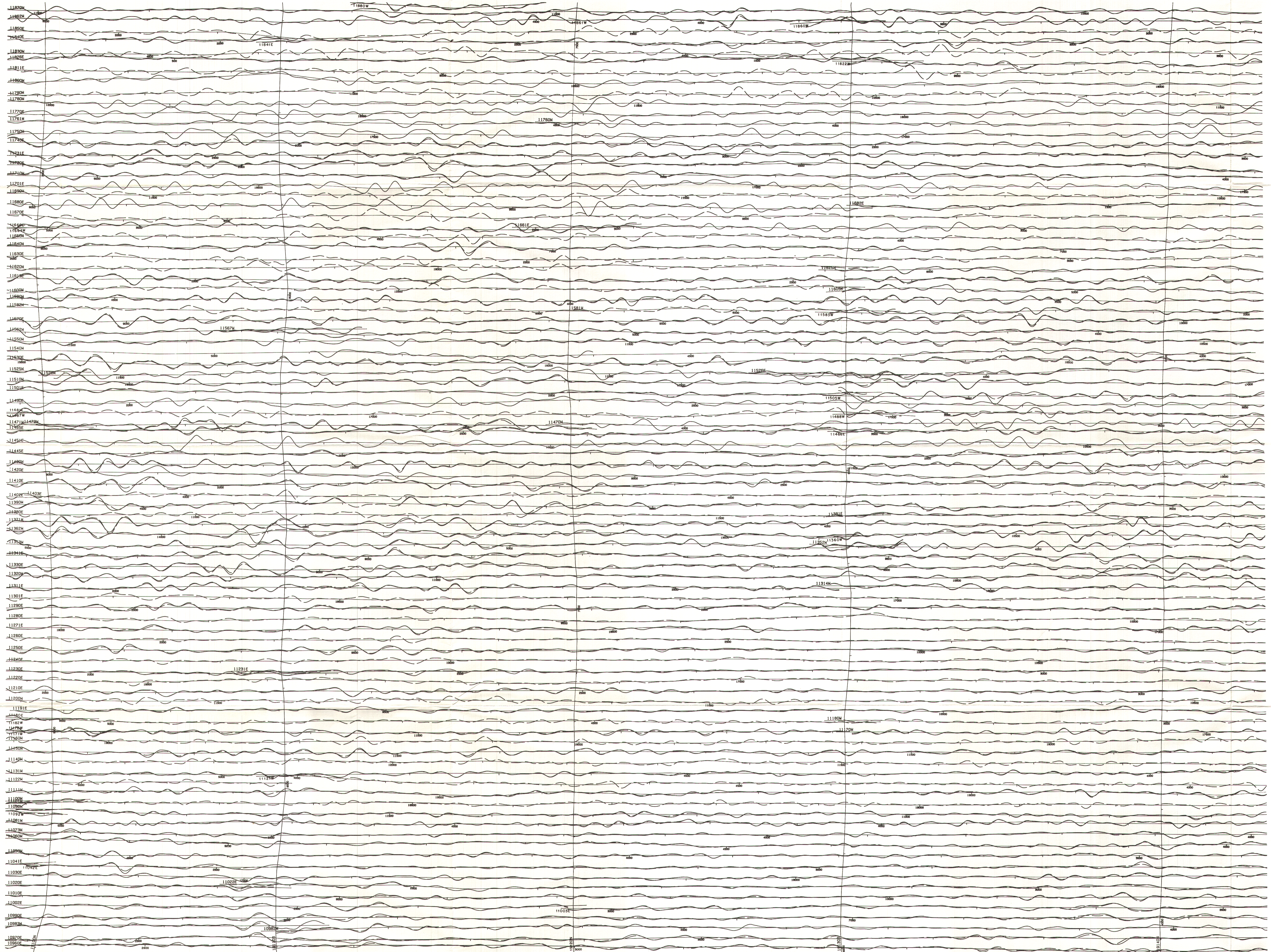
TOTEM VLF EM QUADRATURE PROFILES PROFILS DE QUADRATURE TOTEM EM VLF