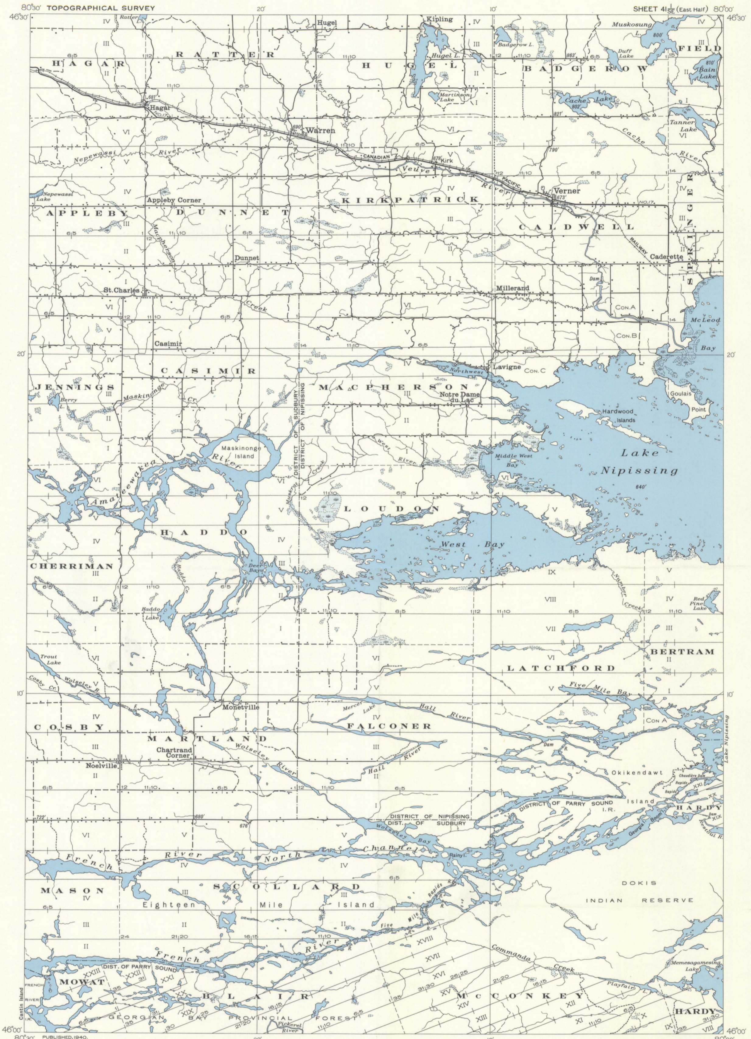
MAP 586A VERNER NIPISSING, SUDBURY, AND PARRY SOUND DISTRICTS ONTARIO Scale, 1:25,000 or 1 Inch to 2 Miles Approximate magnetic declination, 8'45" West.

LEGEND Provincial highway..... NO. 17 Township boundary..... Road and buildings..... Indian Reserve..... I.R. Road not well travelled..... Concession number..... IV Bush road or trail..... Lot number..... 5 Power line..... Stream (position approx.)..... Power line along road..... Fall and rapid..... F.R. Post Office..... Marsh..... Triangulation station..... Height in feet above District boundary..... Mean sea-level..... 640' Compiled by the Topographical Survey, 1939, from aerial photographs taken by the Royal Canadian Air Force, September, 1935, and from information supplied by the Ontario Department of Lands and Forests. Cartography by the Drafting and Reproducing Division, 1940.