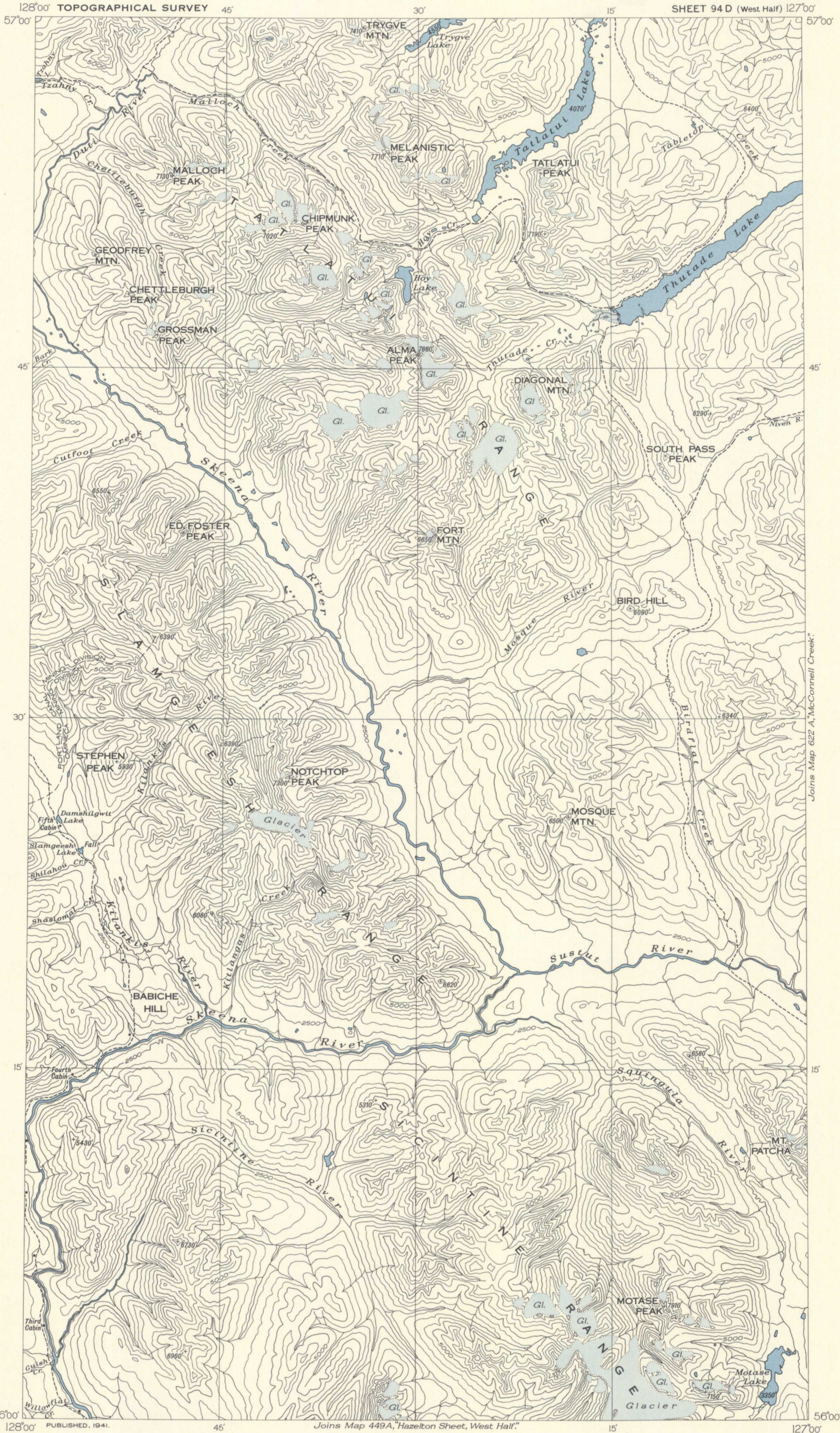
MAP 657A TATLATUI CASSIAR DISTRICT BRITISH COLUMBIA