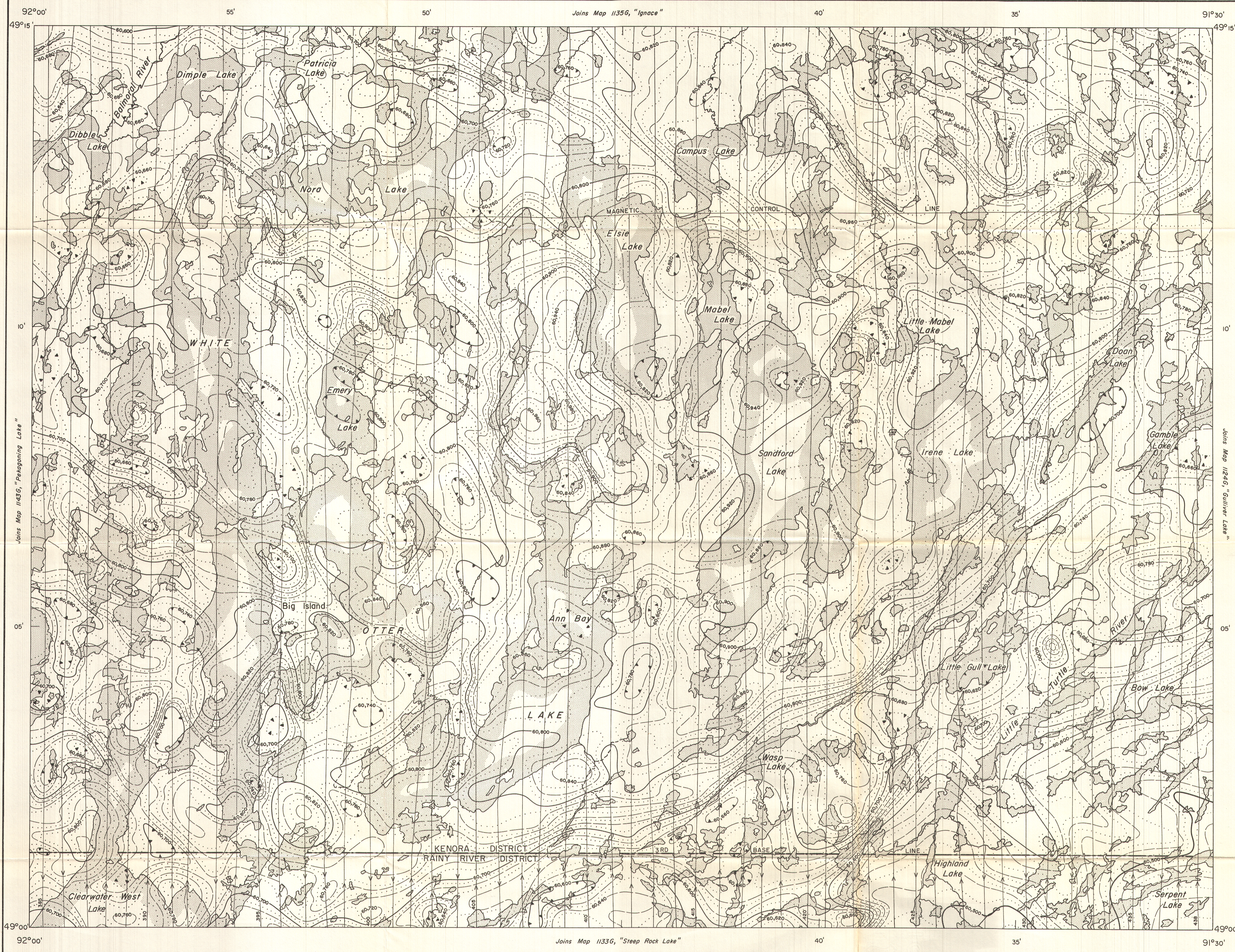
MAP 1134 G