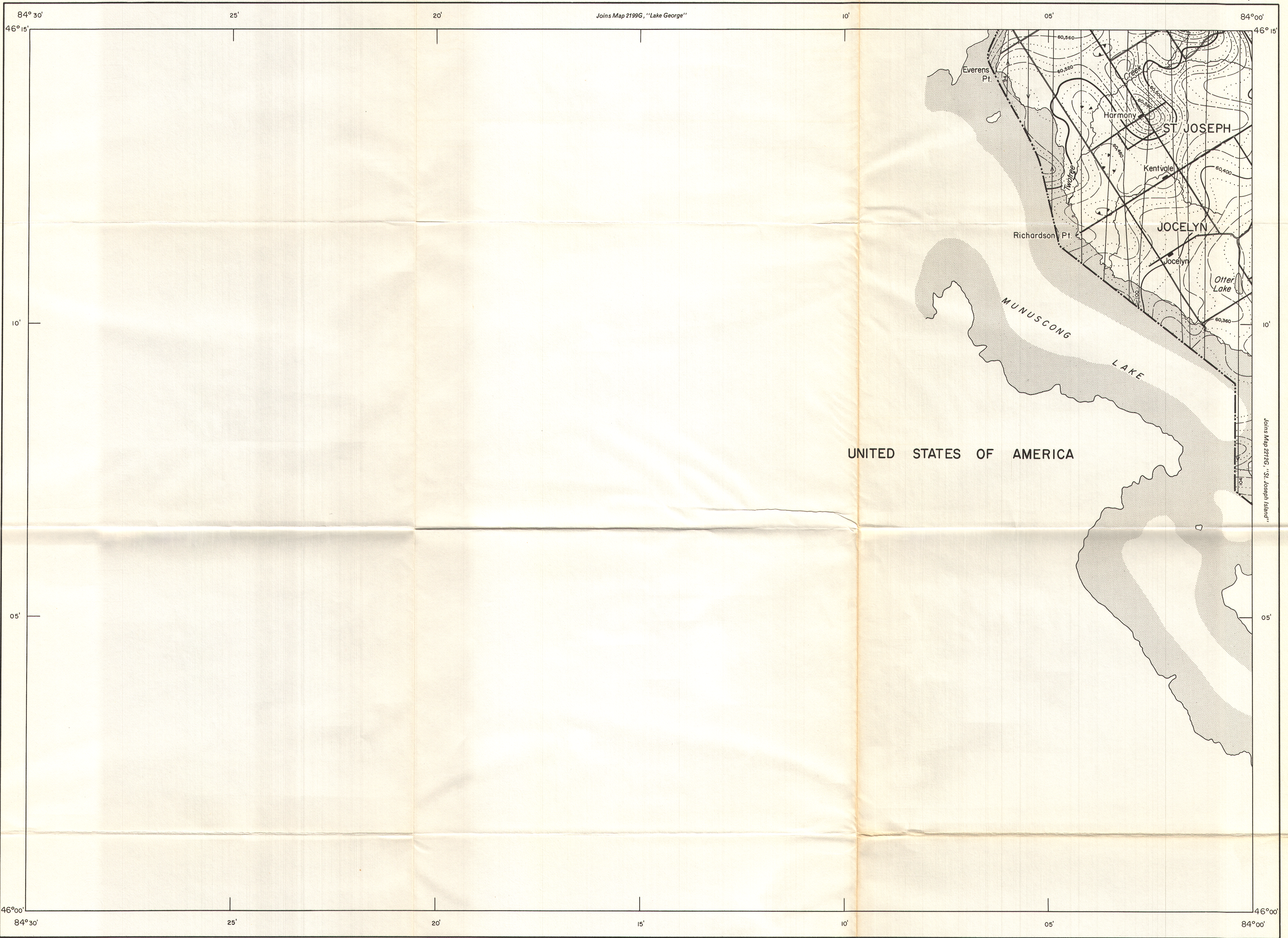
MAP 2198 G