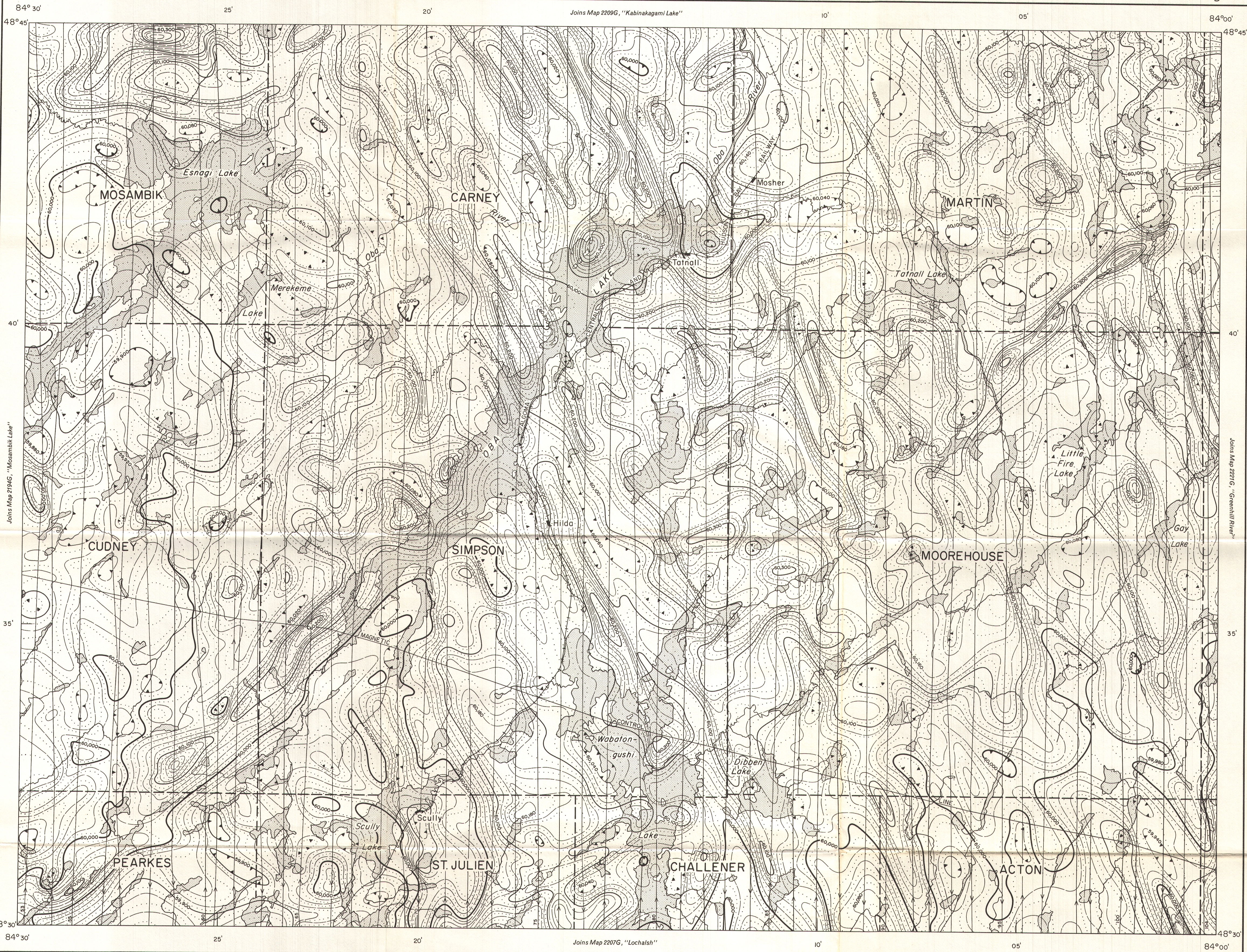
MAP 2208 G