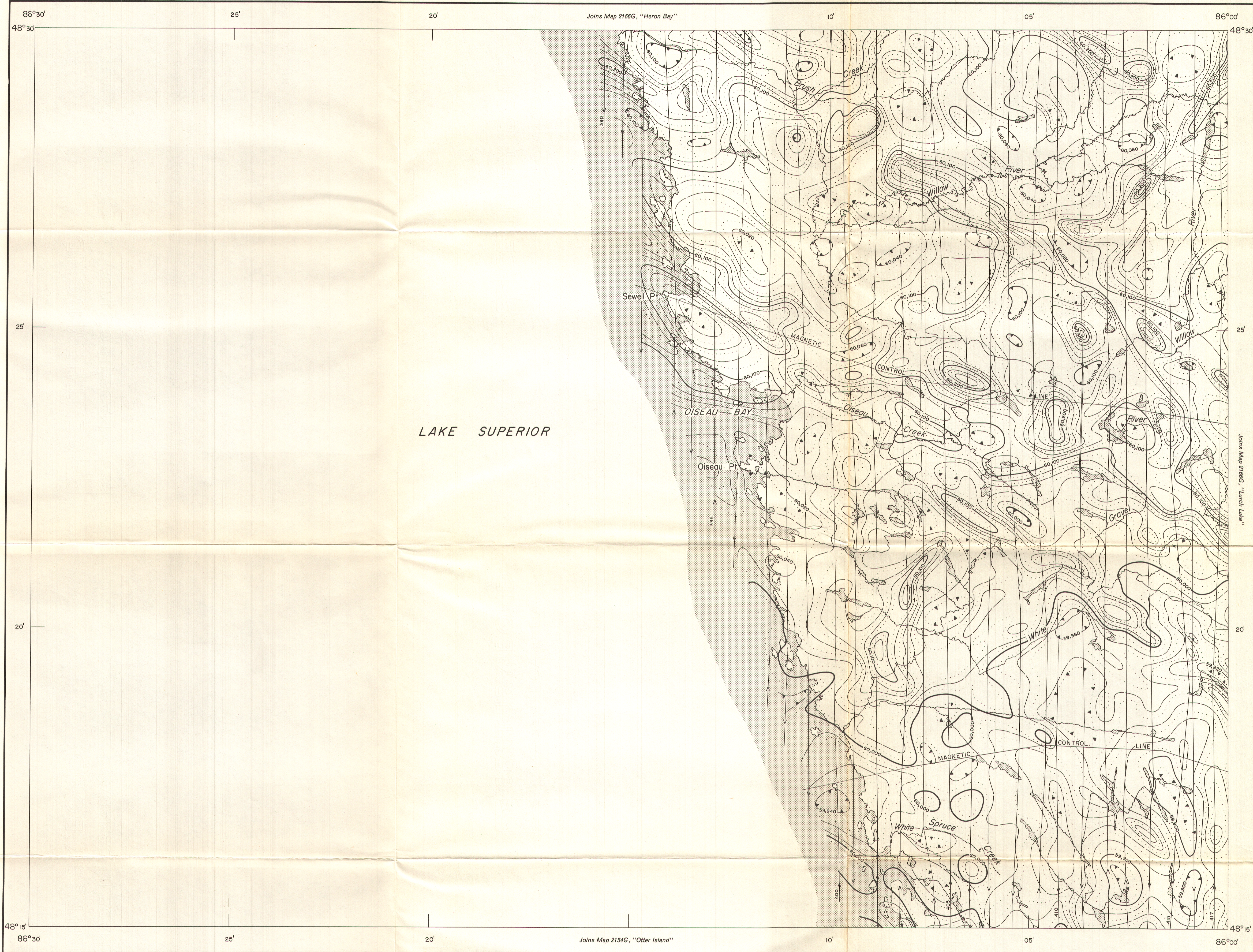
MAP 2155 G