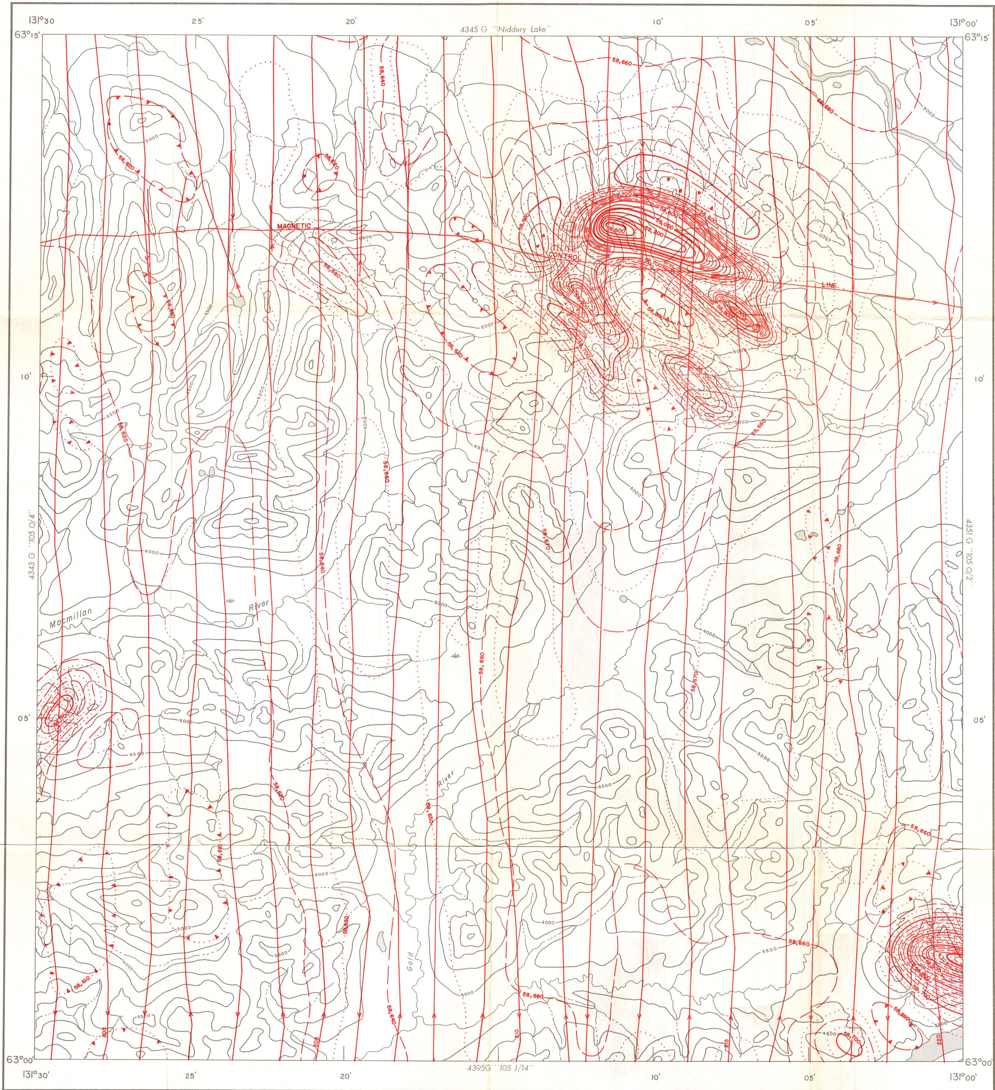
MAP 4344 G