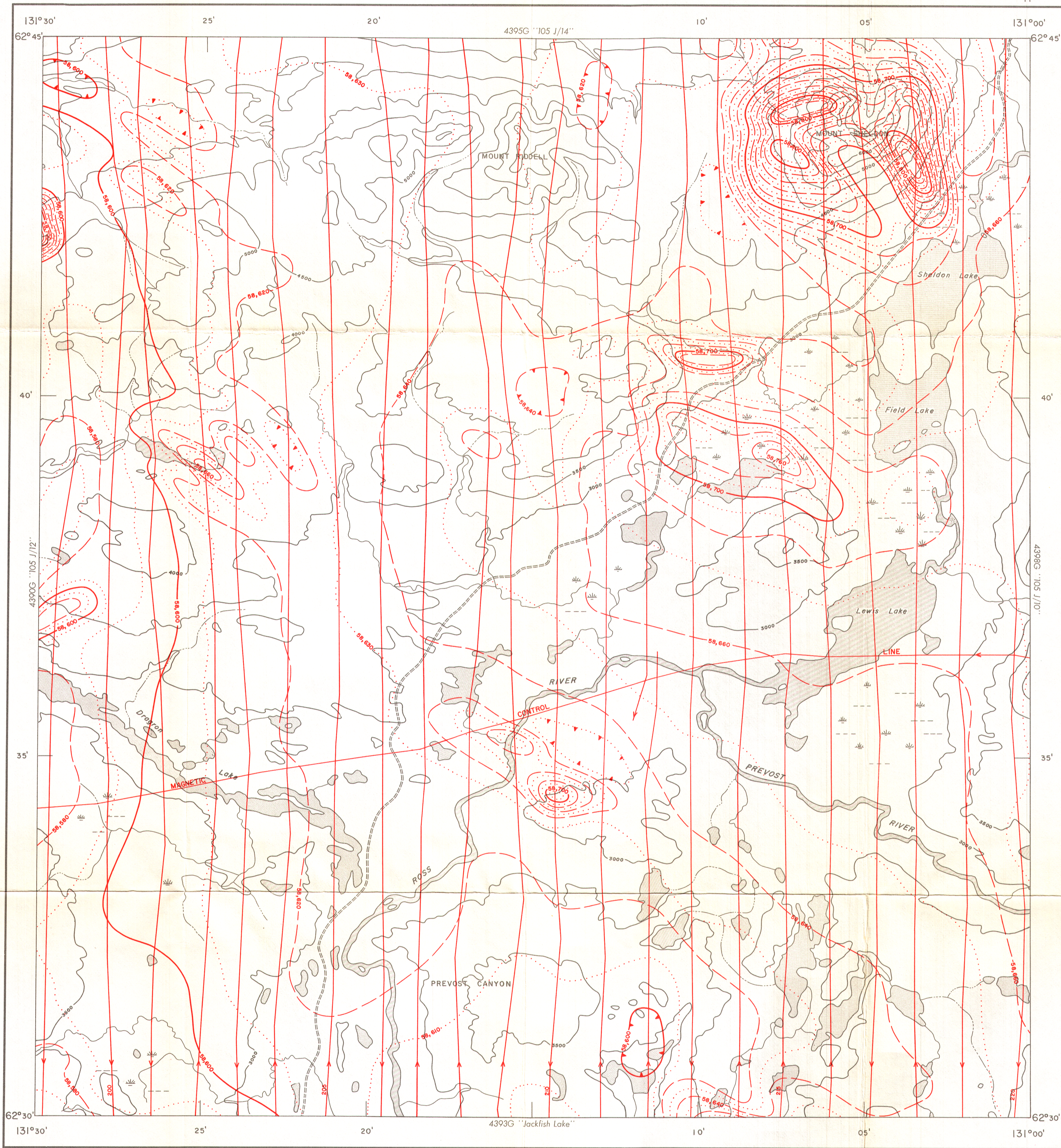
MAP 4394 G