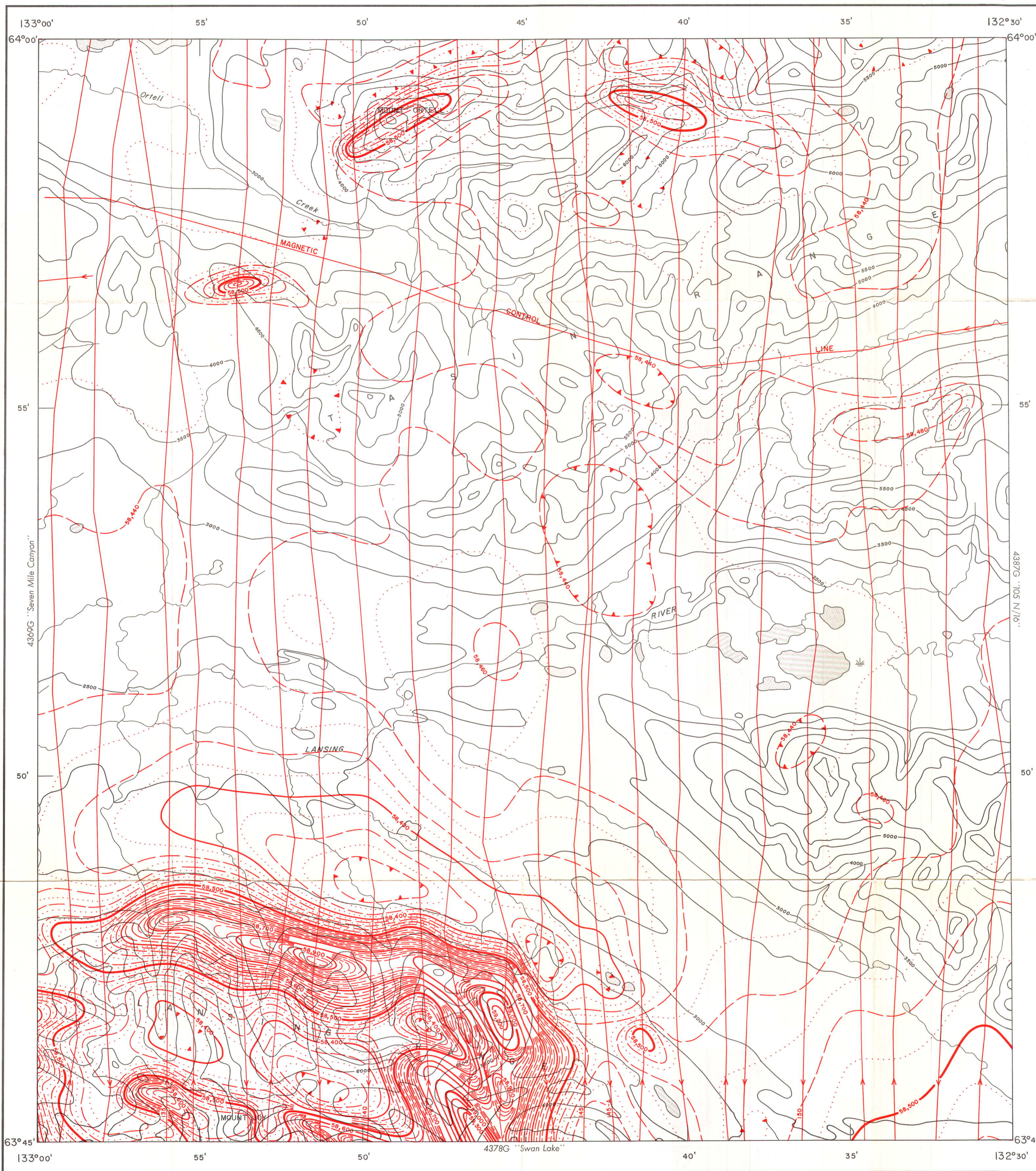
MAP 4379 G