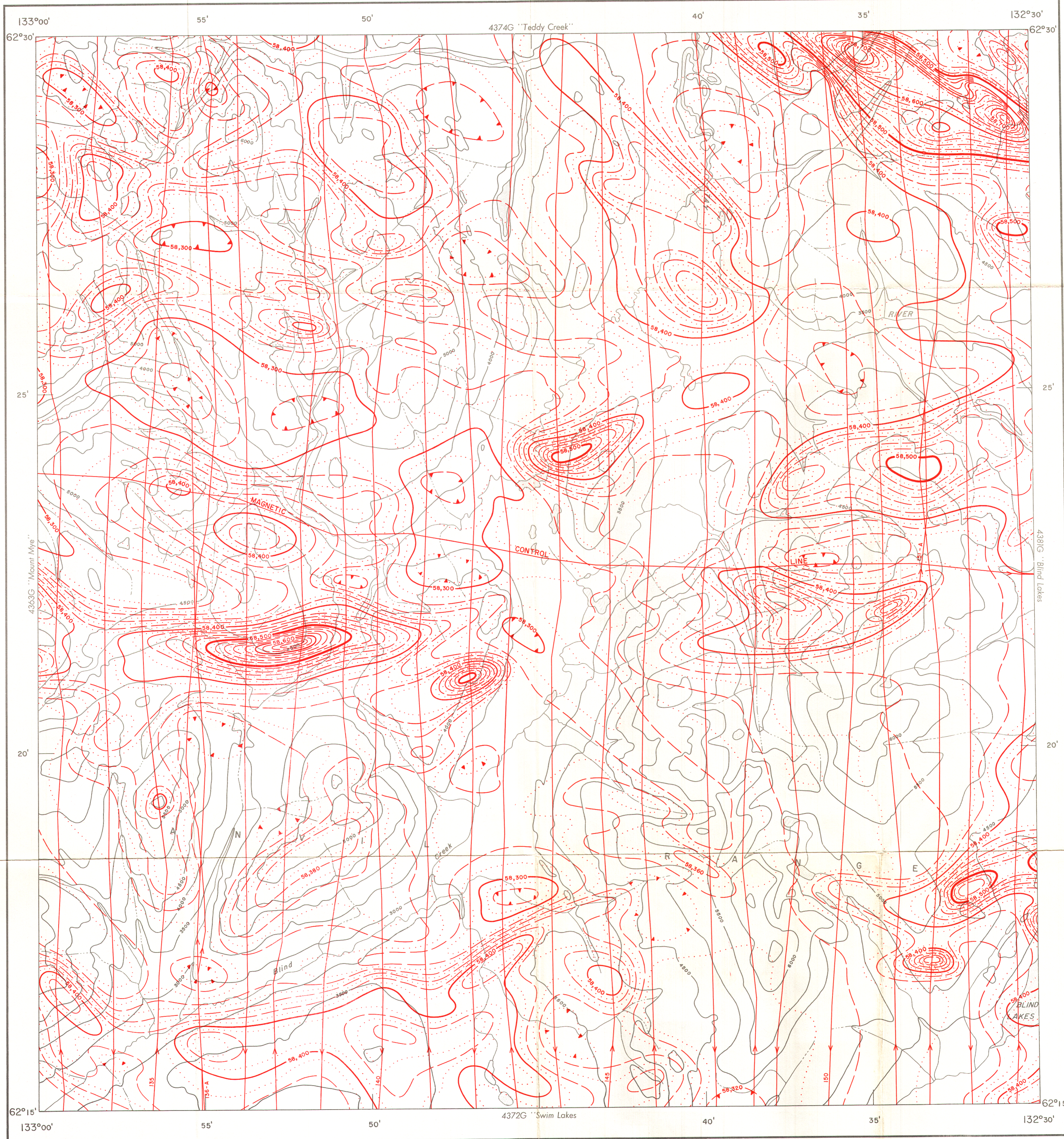
MAP 4373 G