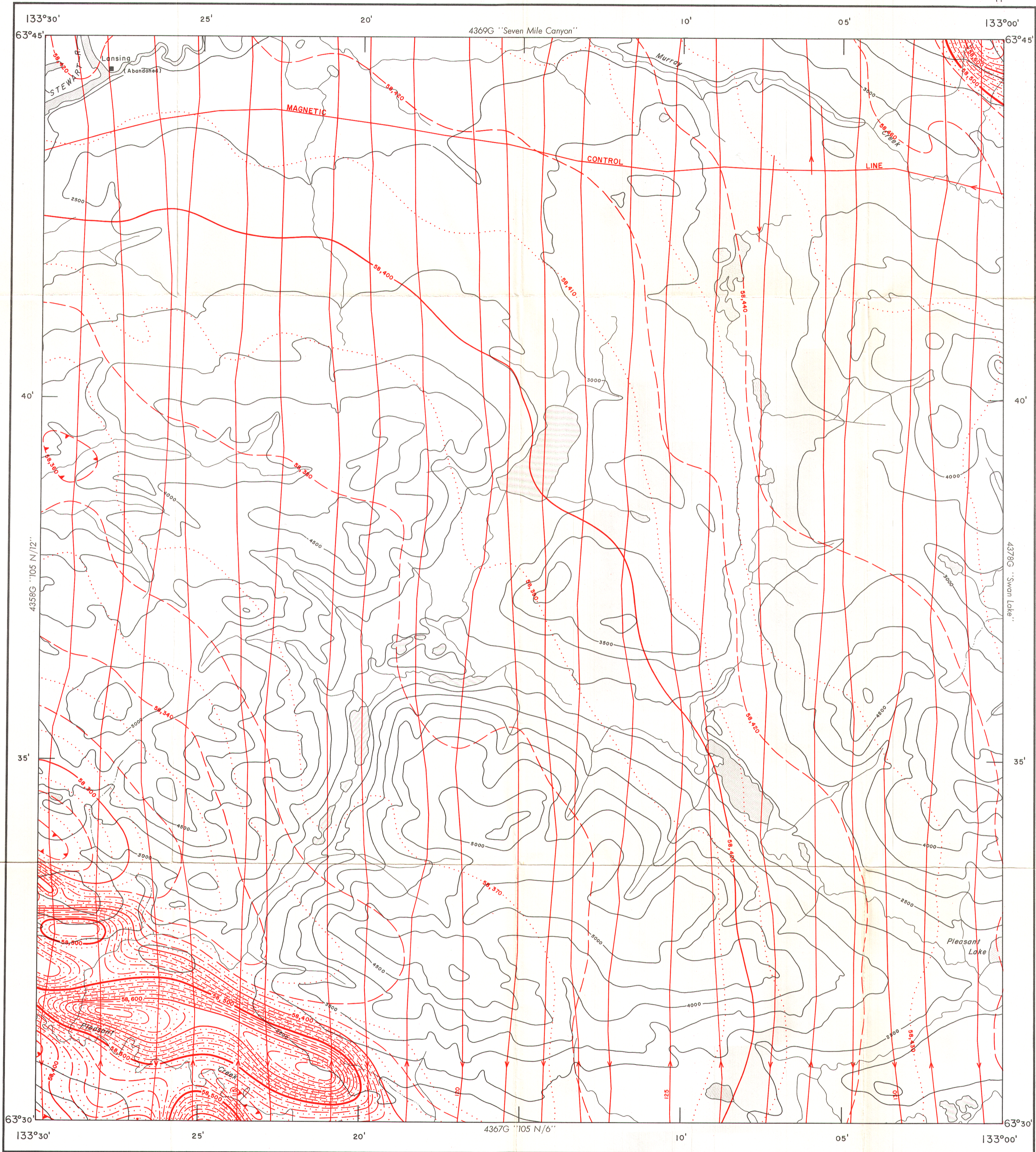
MAP 4368 G