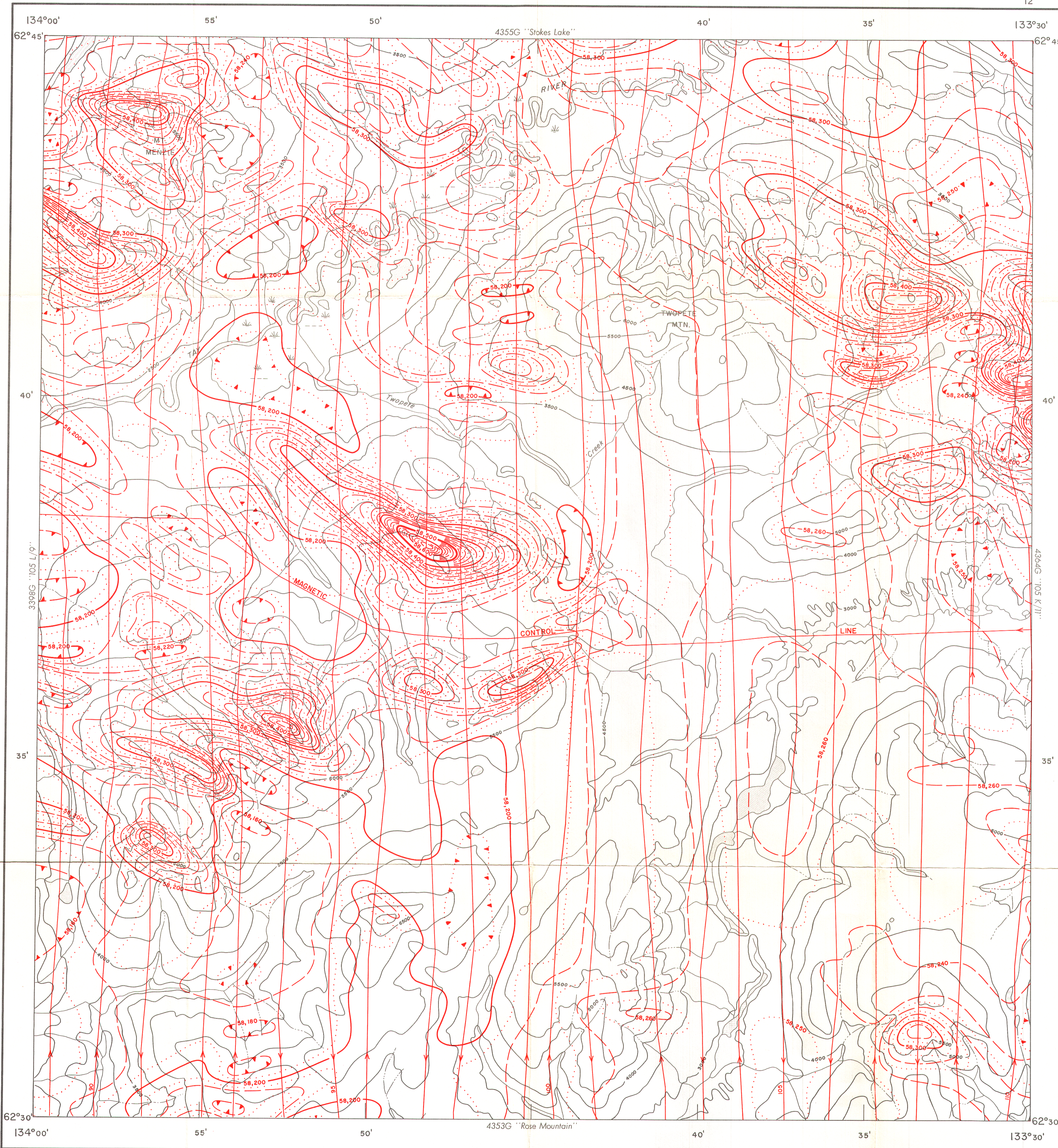
MAP 4354 G