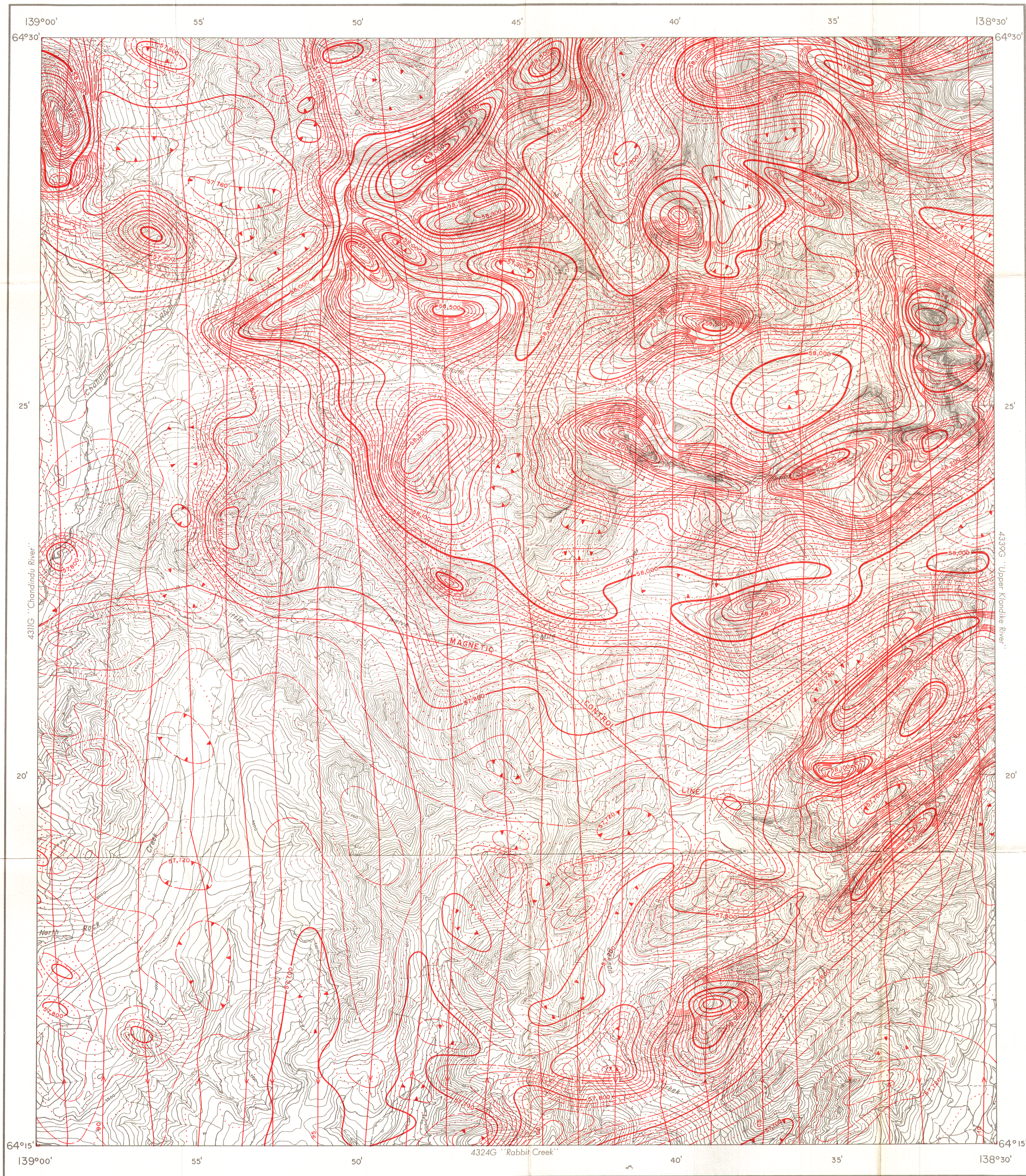
MAP 4325 G