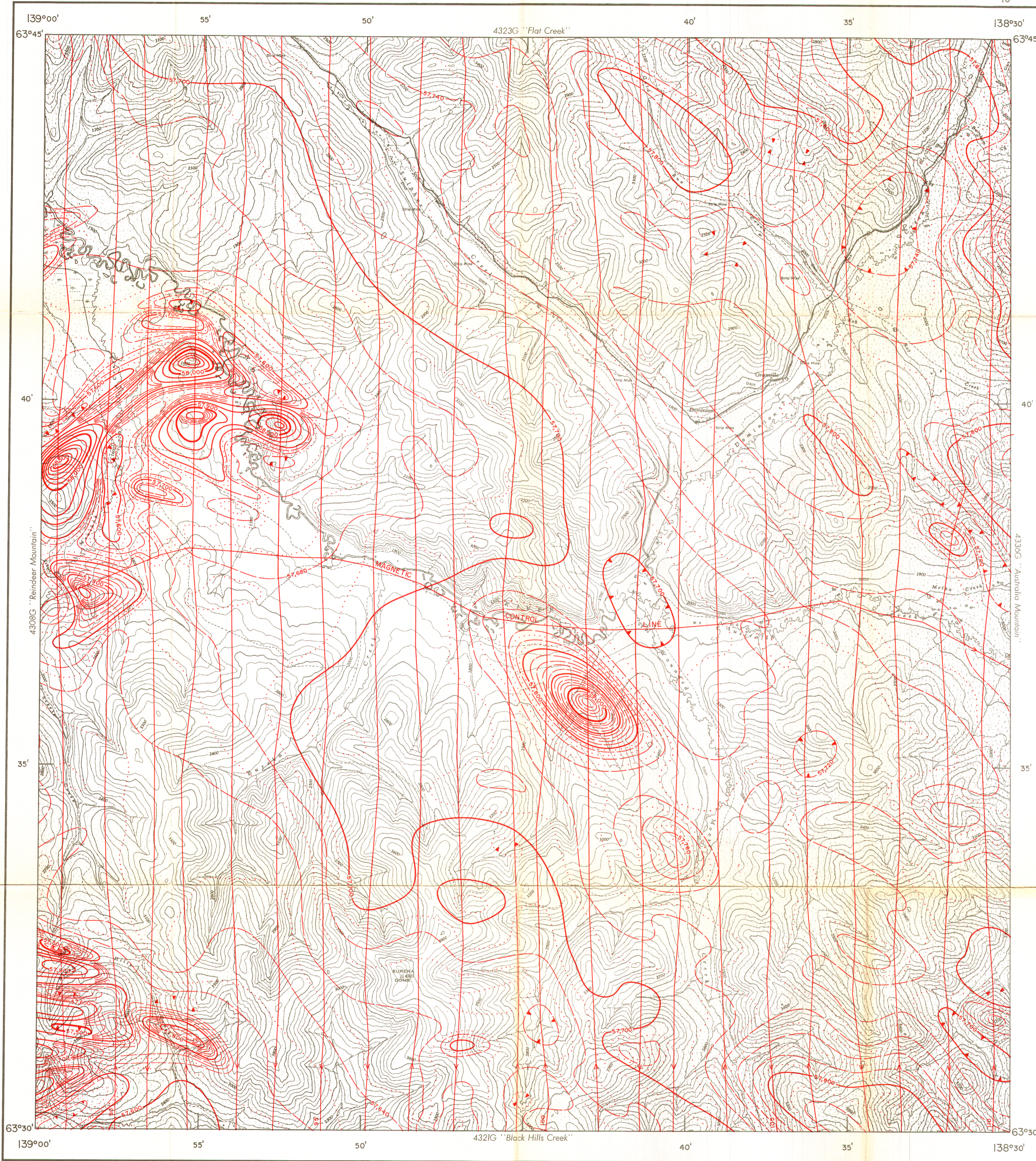
MAP 4322 G