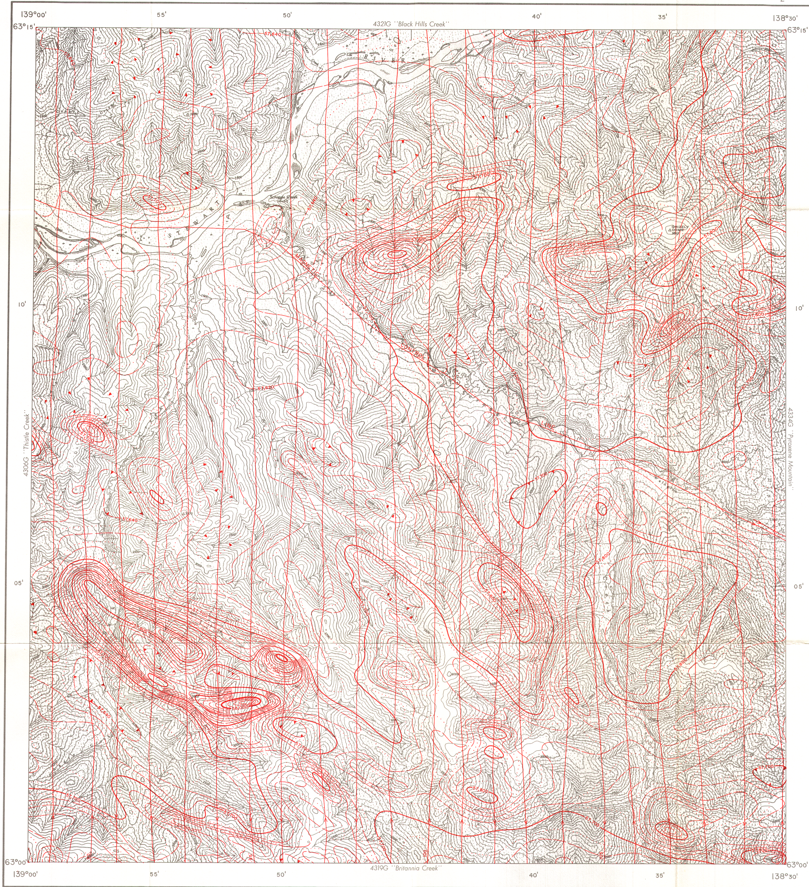
MAP 4320 G