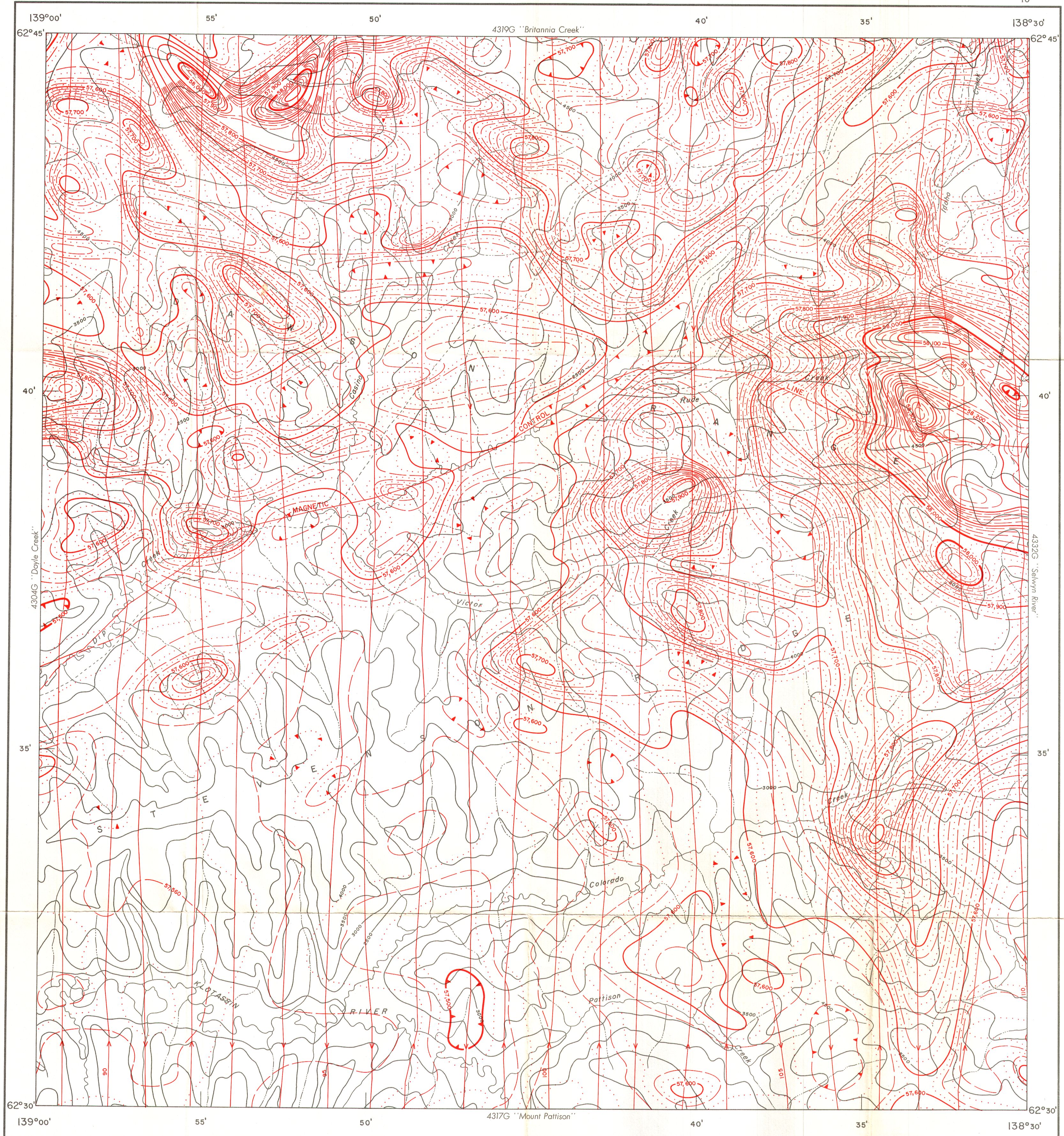
MAP 4318 G