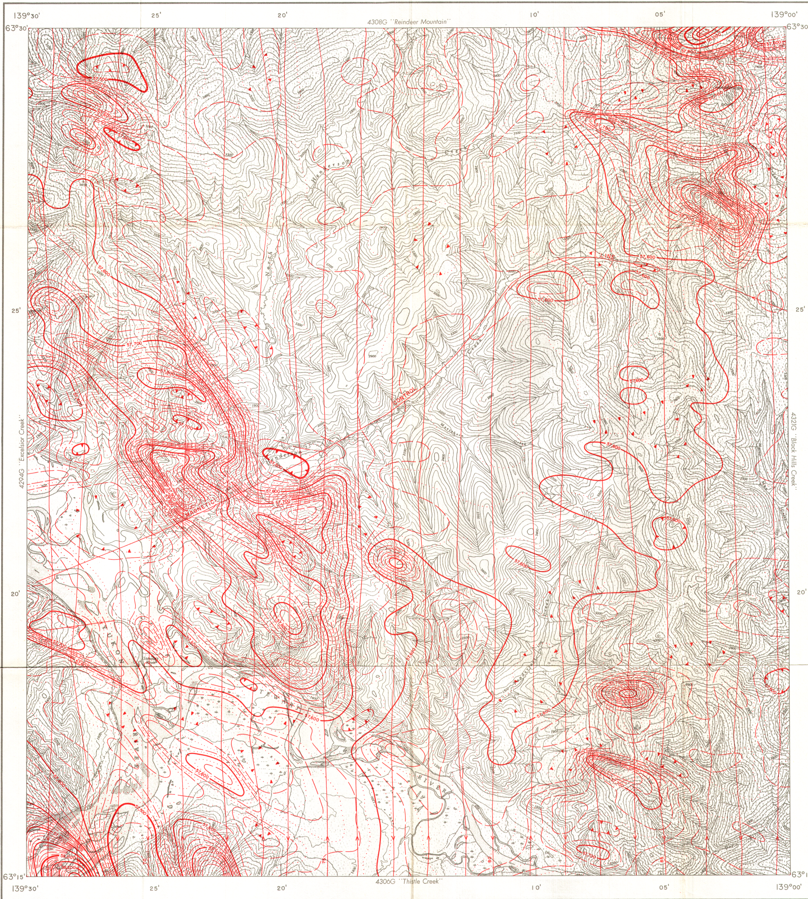
MAP 4307 G