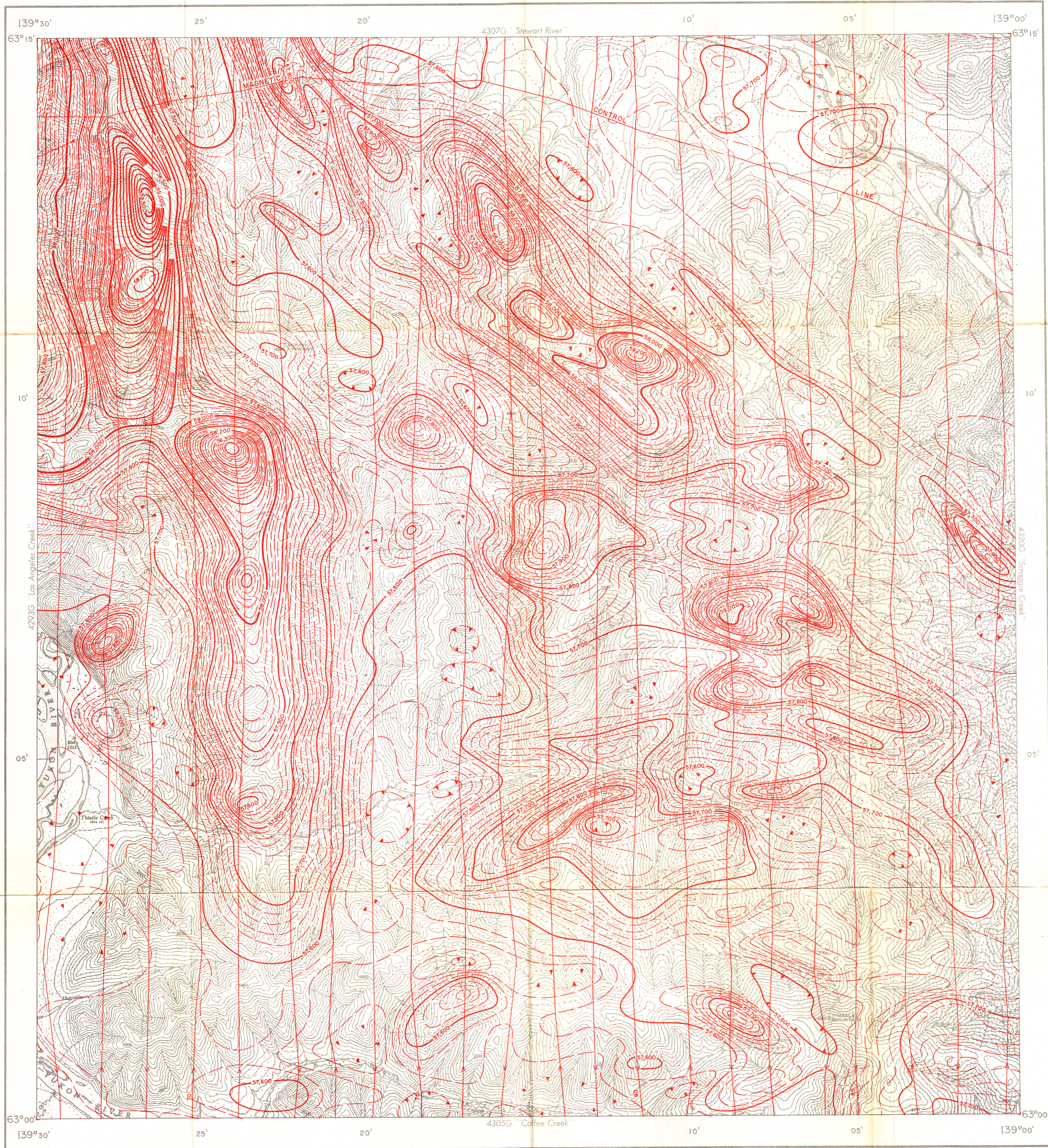
MAP 4306 G