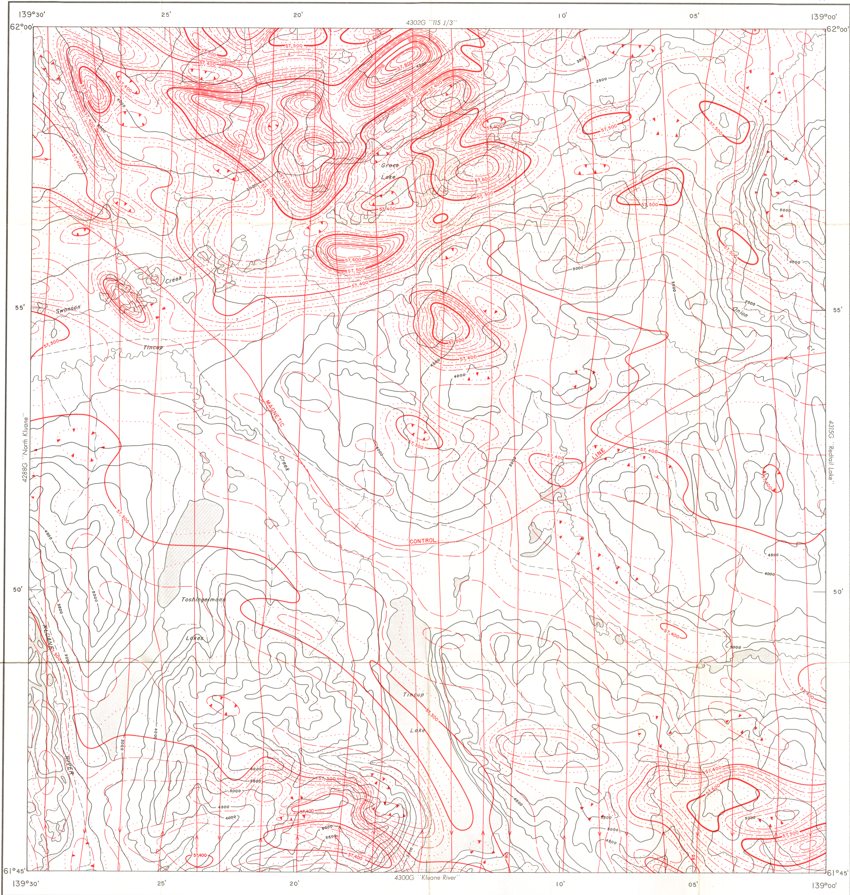
MAP 4301 G