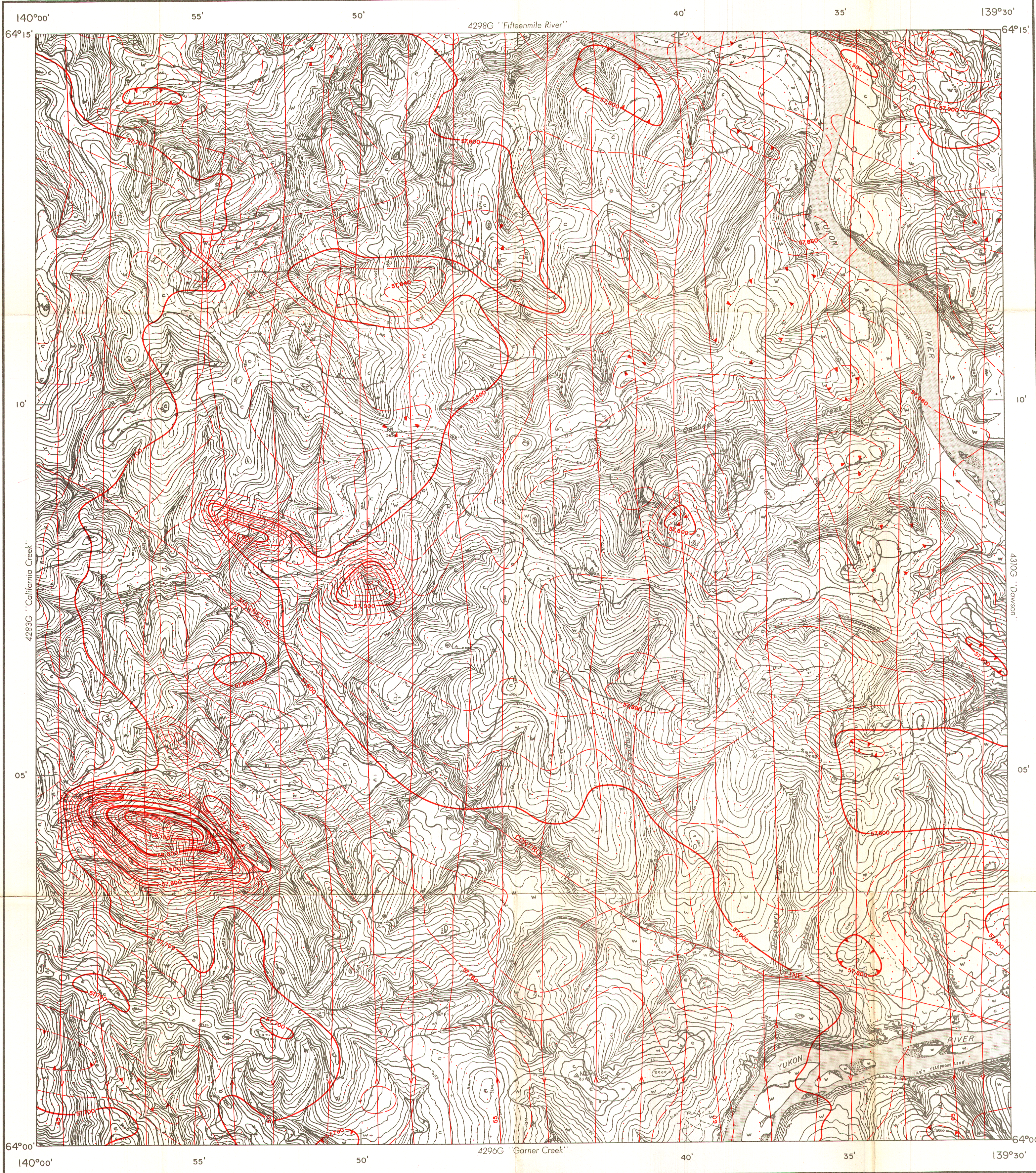
MAP 4297 G