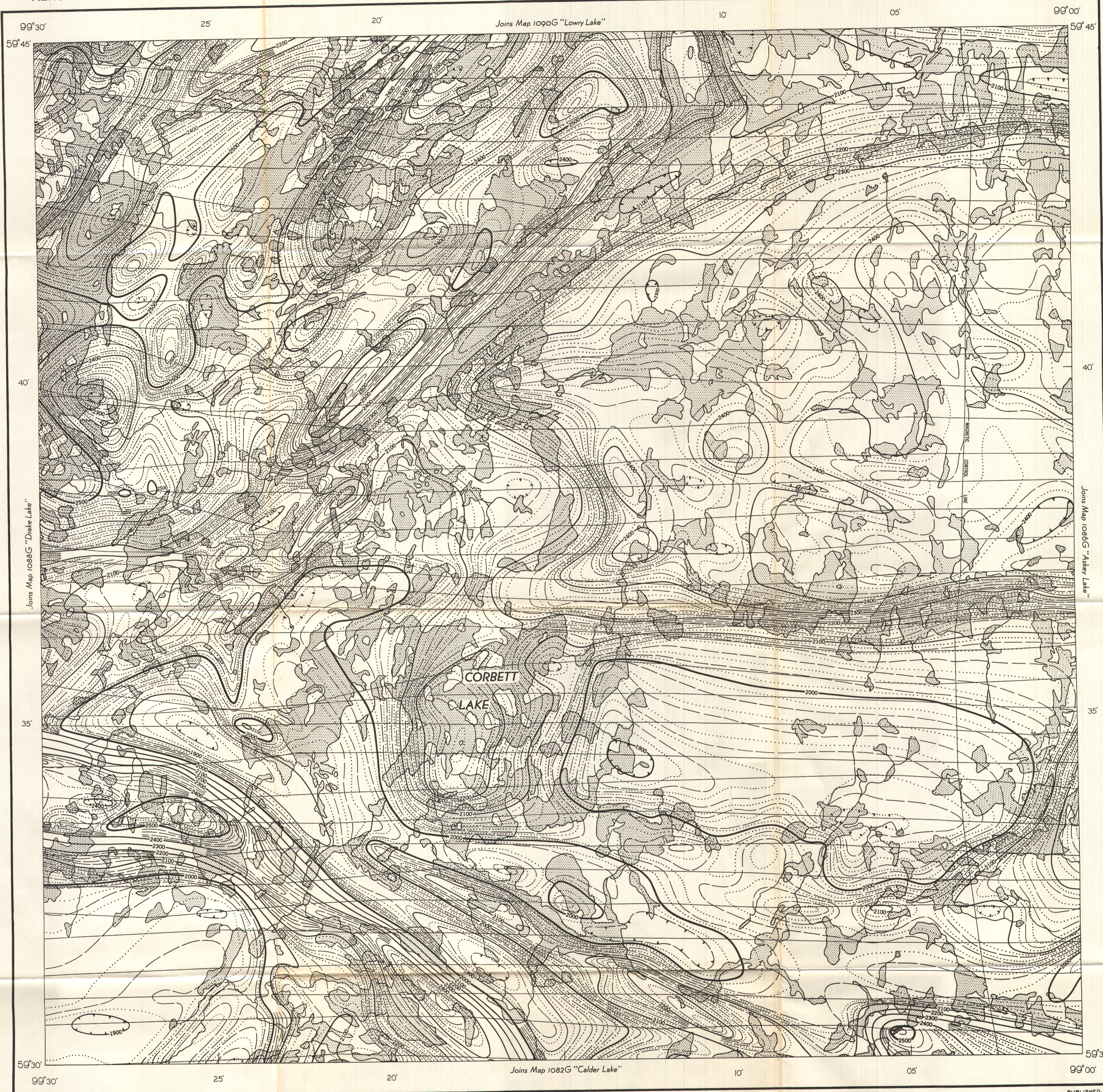
MAP 1087 G