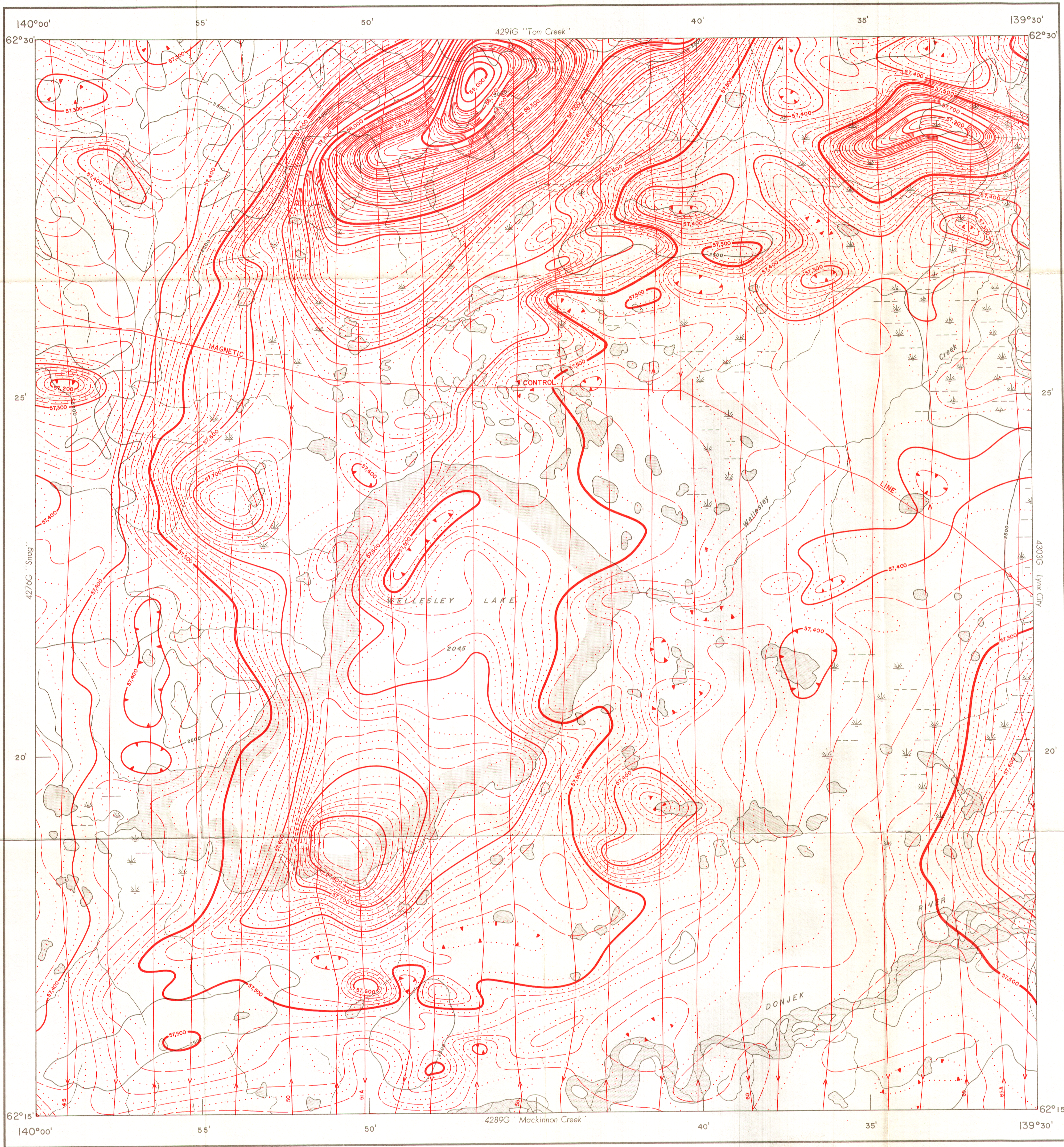
MAP 4290 G