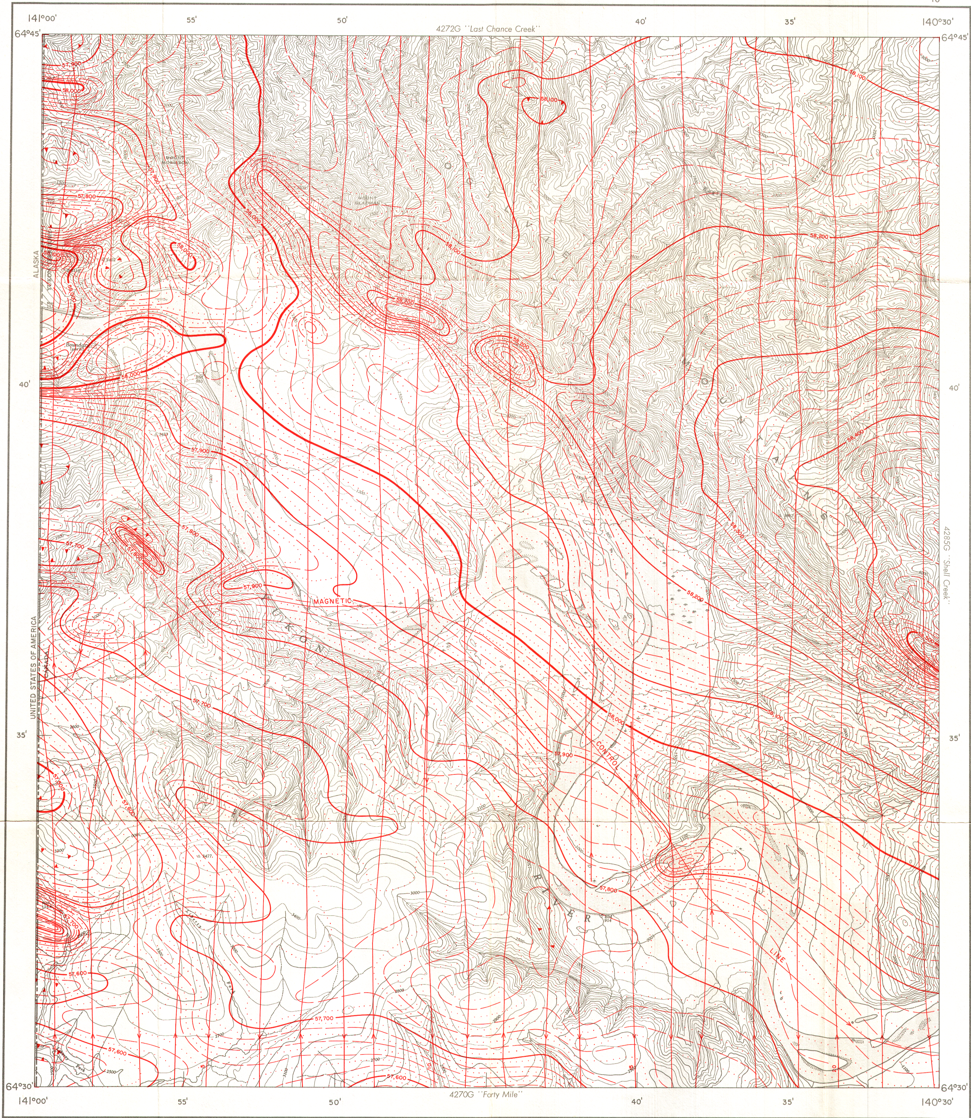
MAP 4271 G