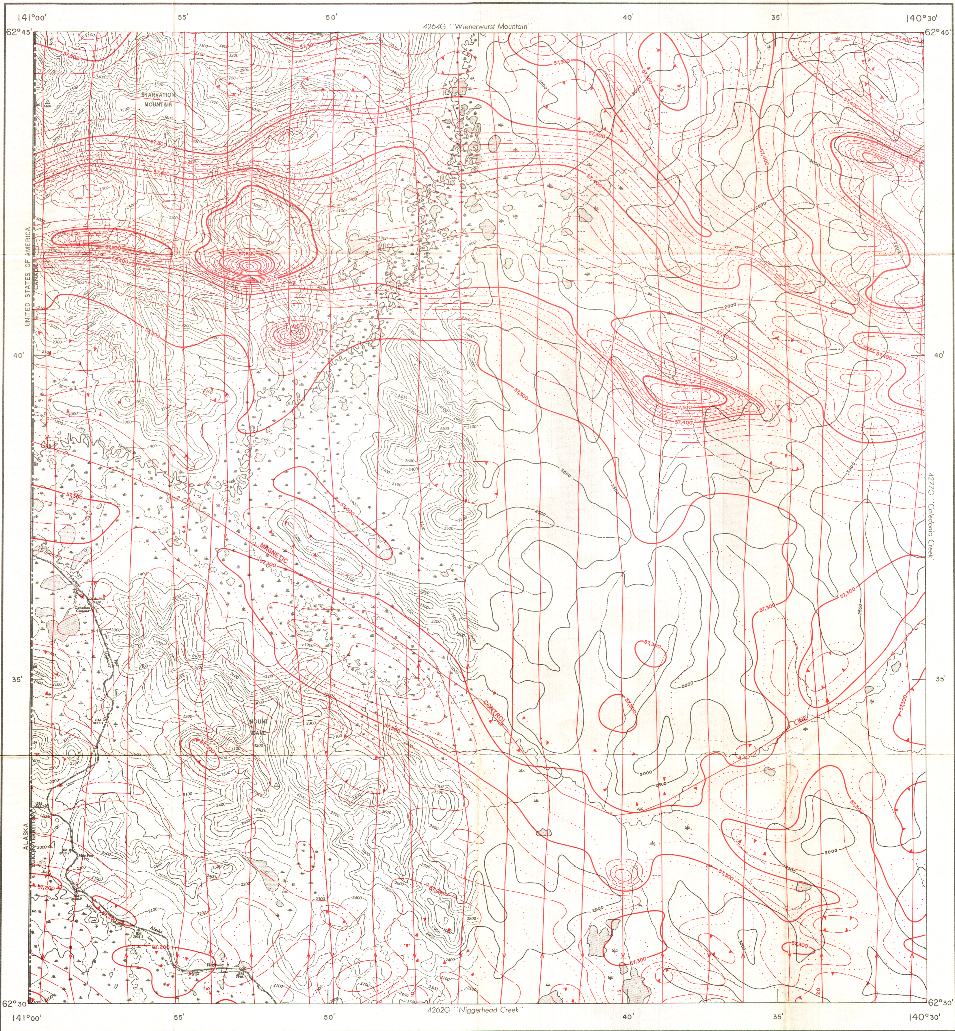
MAP 4263 G