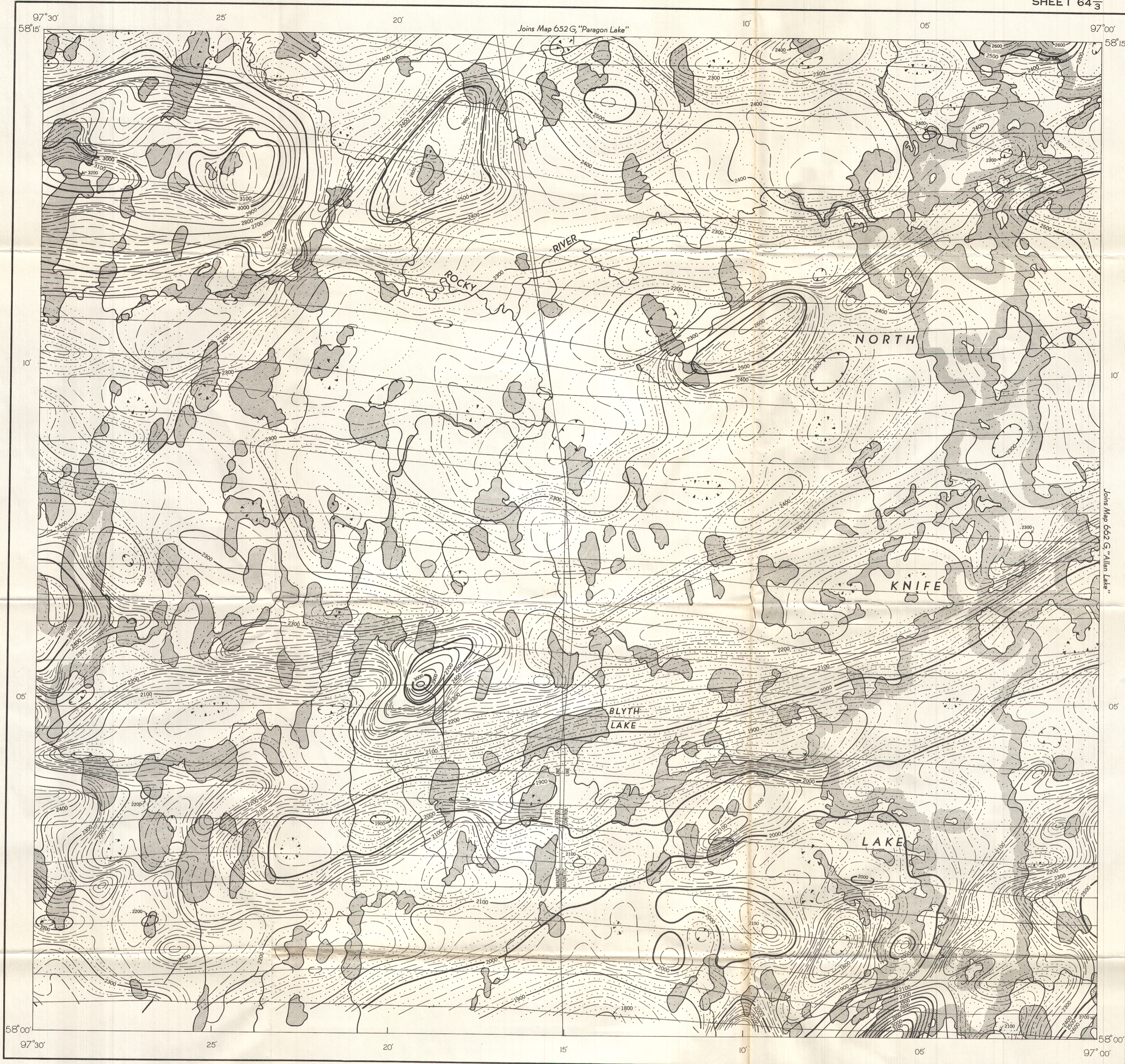
MAP 668 G