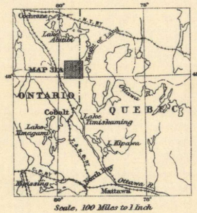
MAP 31 A LARDEY LAKE NIPISSING DISTRICT ONTARIO